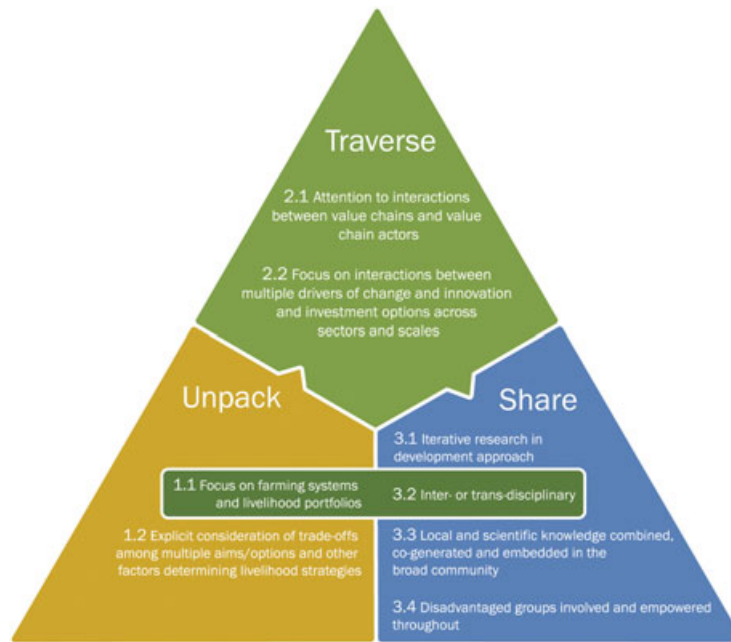
Figure 1. Three integrative principles that can operationalize the new dryland development paradigm. The principles provide a checklist for researchers and an evaluation framework for funders using the new DDP. The principles suggest that dryland development research must Unpack relationships, Traverse scales and sectors and Share knowledge. Each principle comprises a number of characteristics, two of which (1.1 and 3.2) cross-cut two of the principles. [Colour figure can be viewed at wileyonlinelibrary.com ]

Appendix S2 and summarized here under each integrative principle. Table S6 provides exemplar case studies from the CRP-DS in which the principles are operationalized together, with cases ranging from local and national to global studies, across a range of agricultural systems.