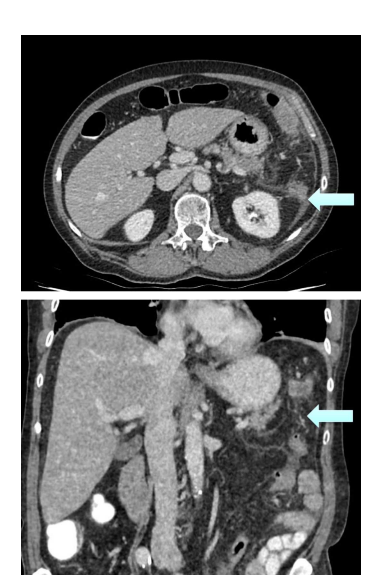
Fig 2 Computed tomographs of the abdomen (in axial and coronal views) showing fat stranding (increased density of fat, a sign of inflammatory process) and thickening (arrows) around the splenic flexure secondary to ischaemic colitis