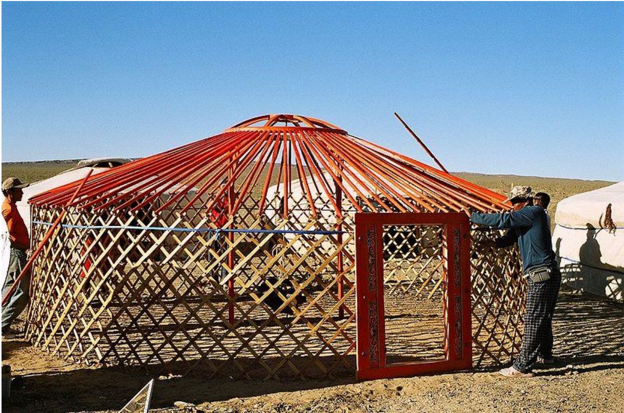
Figure 3: A ger under construction showing uni , toono , bagana and lattice frame panels. ( https://commons.wikimedia.org/wiki/File:Yurt-construction-2.JPG )

These materials hold significance in terms of their transportability and assemblage, a key principle of the nomadic lifestyle. They can usually be dismantled in half an hour and assembled in an hour with a small family of two to three adults (Gundegmaa 2013, 3). The complete frame weighs about 250kg and is designed to be transported by camel in Central Asia and Mongolia (Hyer and Jagchid 1979, 64). Importantly, the lack of archaeological evidence of past ger camps illustrates the fundamental aspect of the structure as a dwelling that leaves few marks of habitation on the landscape (see Cribb 1991 for a comparable example).