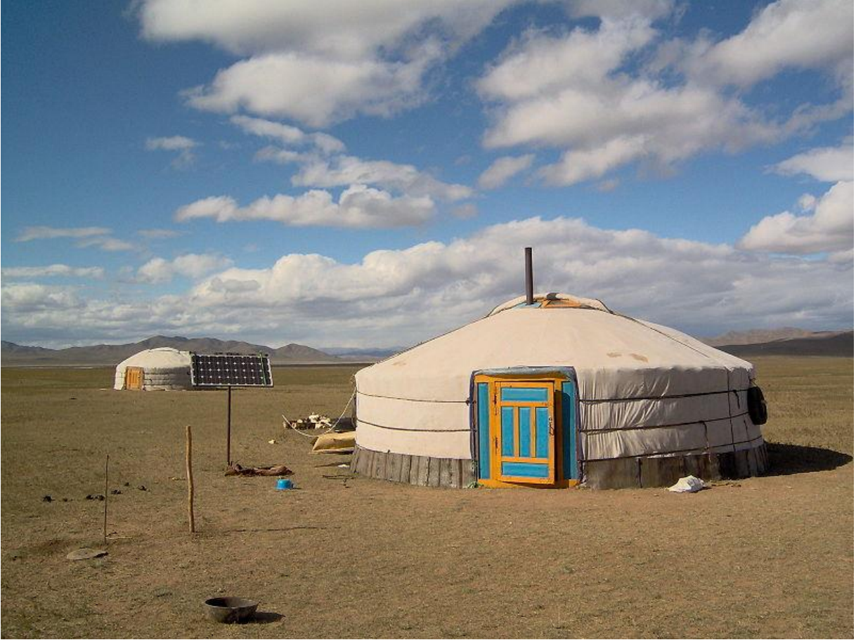
Figure 1: A traditional rural ger in Mongolia.

https://commons.wikimedia.org/wiki/File:Mongolia_013.jpg