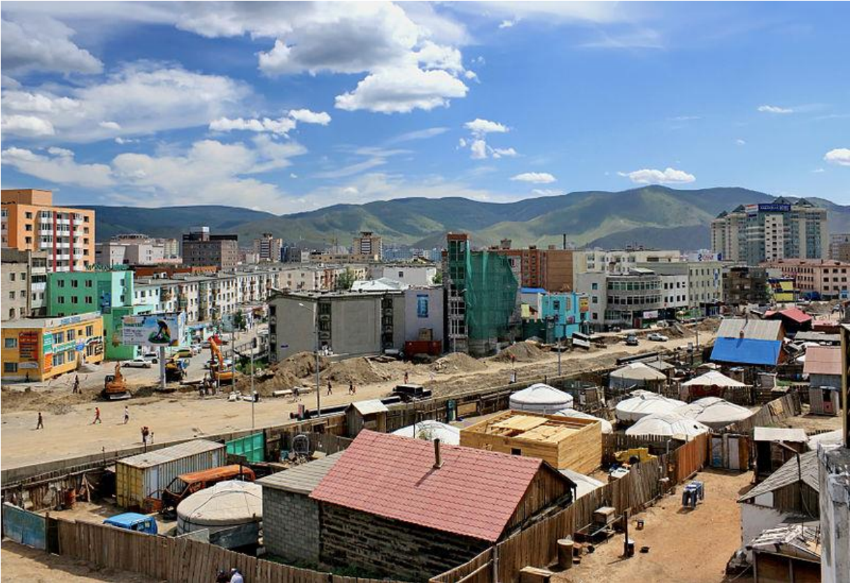
Figure 2: A sedentary ger settlement in the capital city of Ulanbaatar, Mongolia