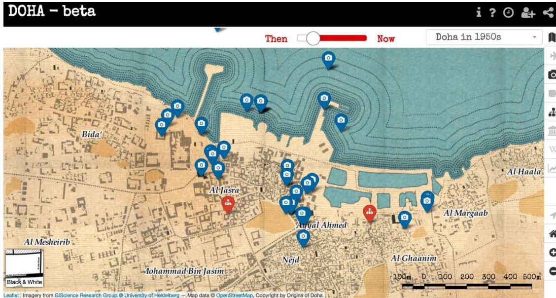
Fig. 3 – DOHA: the Doha Online Historical Atlas

Finally, we have created the Doha Online Historical Atlas (DOHA: http://originsofdoha.org/doha/ ), an online historical Geographic Information System (GIS) (BODENHAMER, 2010). DOHA presents research from the Origins of Doha team as visualized on an interactive map of Doha. Users of the interface can overlay historic aerial photos and increase and decrease visibility of these photos on the modern landscape. Aerial oblique imagery is also noted on the map, complete with location and angle of the photograph.