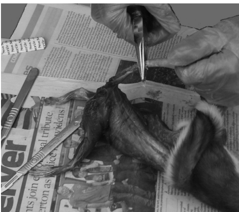
Figure 4.1 (top left), Making the first incision just below the sternum and rib cage, peeling the skin back as soon as possible with the fingers. Photo taken by Jen Harland. Figure 4.2 (top right), Beginning to push the limb through, towards the rest of the carcass and away from the skin. Photo taken by Jen Harland. Figure 4.3 (middle left), Pulling the pelt and limb apart, revealing the foot, which remained intact. Photo taken by Jen Harland. Figure 4.4 (middle right), Using the hands to pull the pelt off the carcass. Photo taken by Jen Harland. Figure 4.5 (bottom left), Trying to get a firm grip on the tail so that it could be pulled inside-out like the legs. The tail broke, leaving some of the tail inside the pelt. Note the intact feet. Photo taken by Sue Archer.