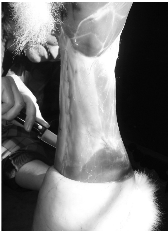
Figure 4.7 The pelt peeling off the torso of the hare, requiring only slight pressure from the hand or knife.

Post-skinning, the head was detached from the carcass after the neck had been cut to drain off any