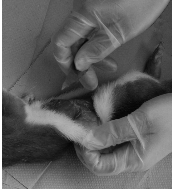
Figure 4.6 The flint used to skin the second stoat.

The ease with which the skin parted from the carcass felt the same as it had with the unfrozen carcass, reinforcing the impression that, for stoats at least, there is no difference between skinning a fresh and frozen carcass. The areas where it was felt some marks could be left on the bones were again perhaps the sternum and definitely over the skull. Once again the vent area was treated with great caution, as this appeared to be an older male and the smell was already very strong without puncturing the scent glands. As with the first stoat, the tail was the most difficult to skin, and again it was not skinned successfully. This time the end of the tail broke off completely, pelt and bone, away from the rest of the carcass and pelt.