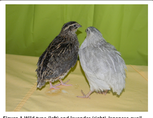
Figure 1 Wild-type (left) and lavender (right) Japanese quail.

All Japanese quail were produced and maintained at the INRA Experimental Unit PEAT in Nouzilly, France (Pôle d'Expérimentation Avicole de Tours, F-37380 Nouzilly, authorization B37-175-1, 2007) in accordance with European Union Guidelines for animal care, under authorization 37–002 delivered to D. Gourichon by the French Ministry of Agriculture. Animal procedures were