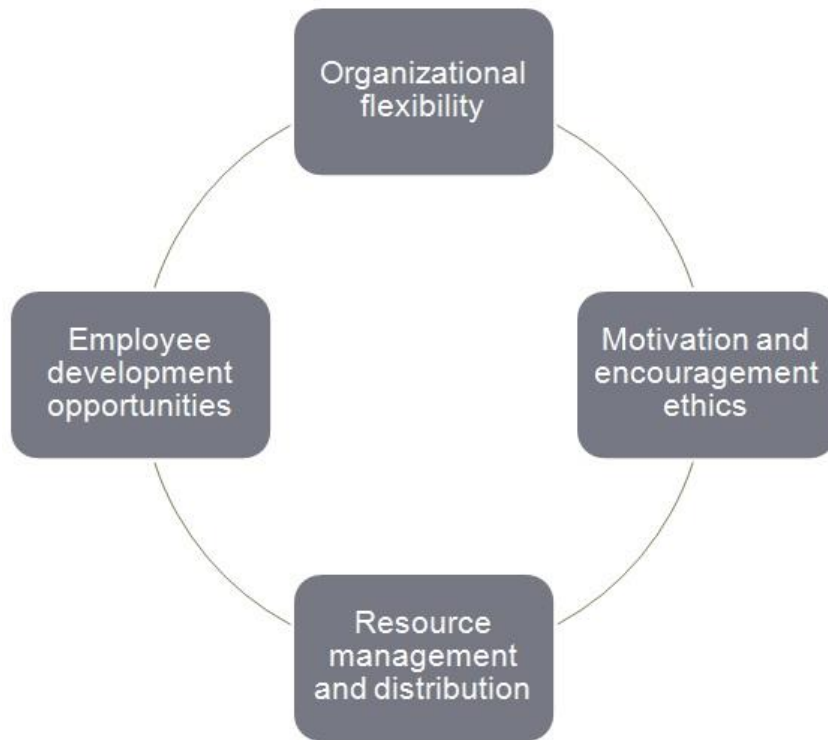
Figure 1 Factors influencing intrapreneurial climate