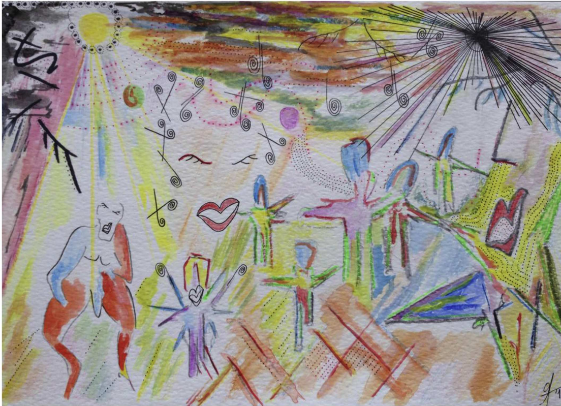
Fig. 1. Techno-space. Drawing by the author.

what you want to become, and, then, fall in love with yourself, as if I myself am an epitome of Pygmalion.