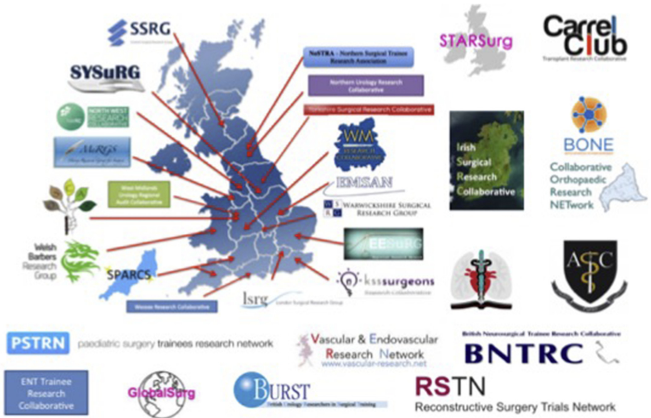
Fig. 1. Active trainee research collaboratives in the UK.