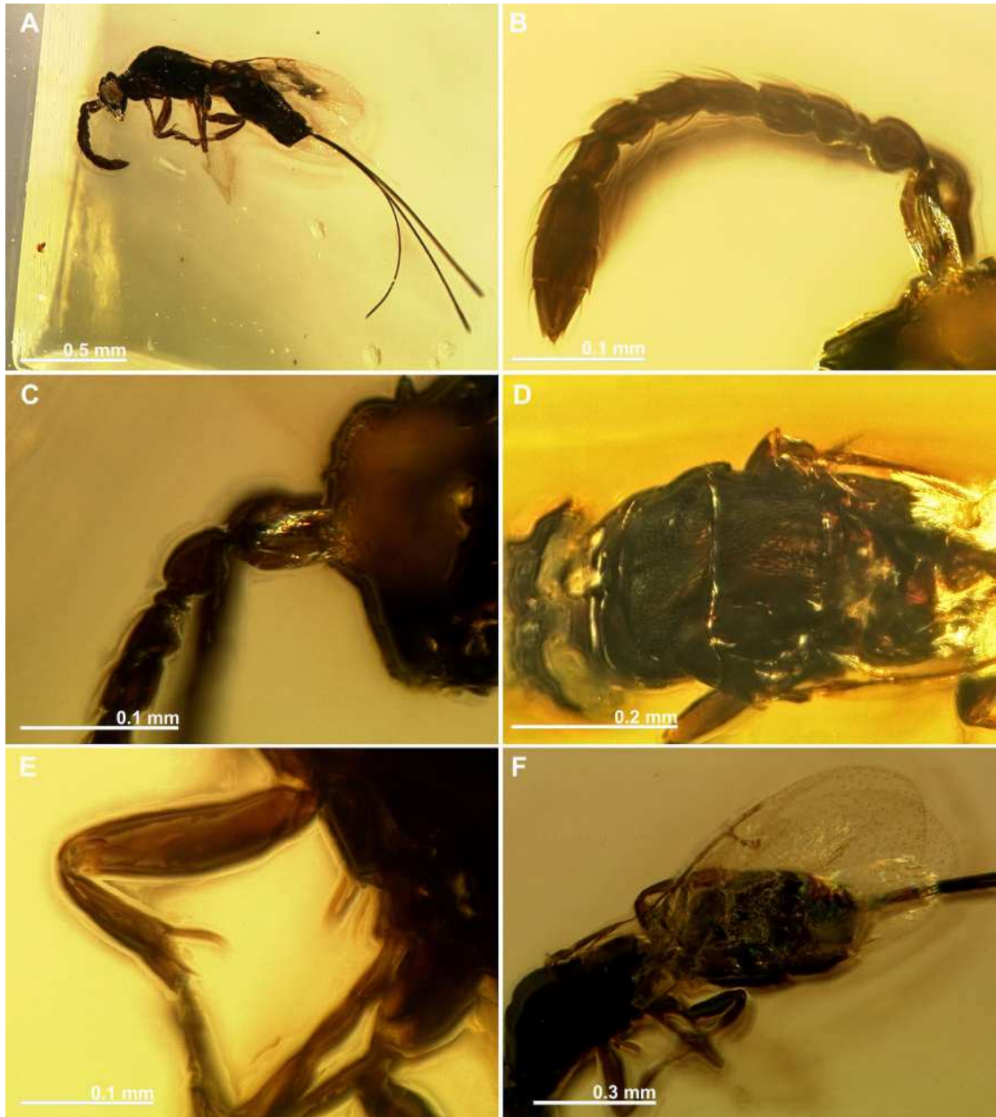
Figure 1: Idarnes thanatos sp. nov. Female. A habitus in lateral view B antenna C detail of antenna D mesosoma in dorsal view E detail of profemur and protibia F wings.