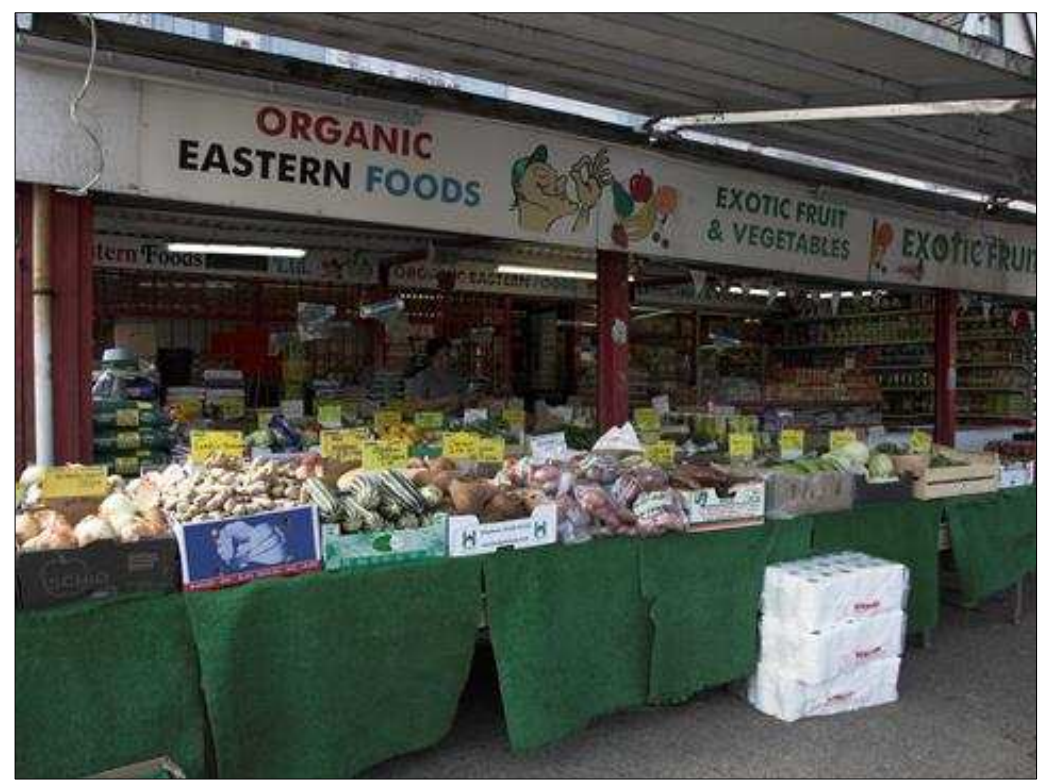
[Figure 8. Monolingual signage; multilingual customers.]