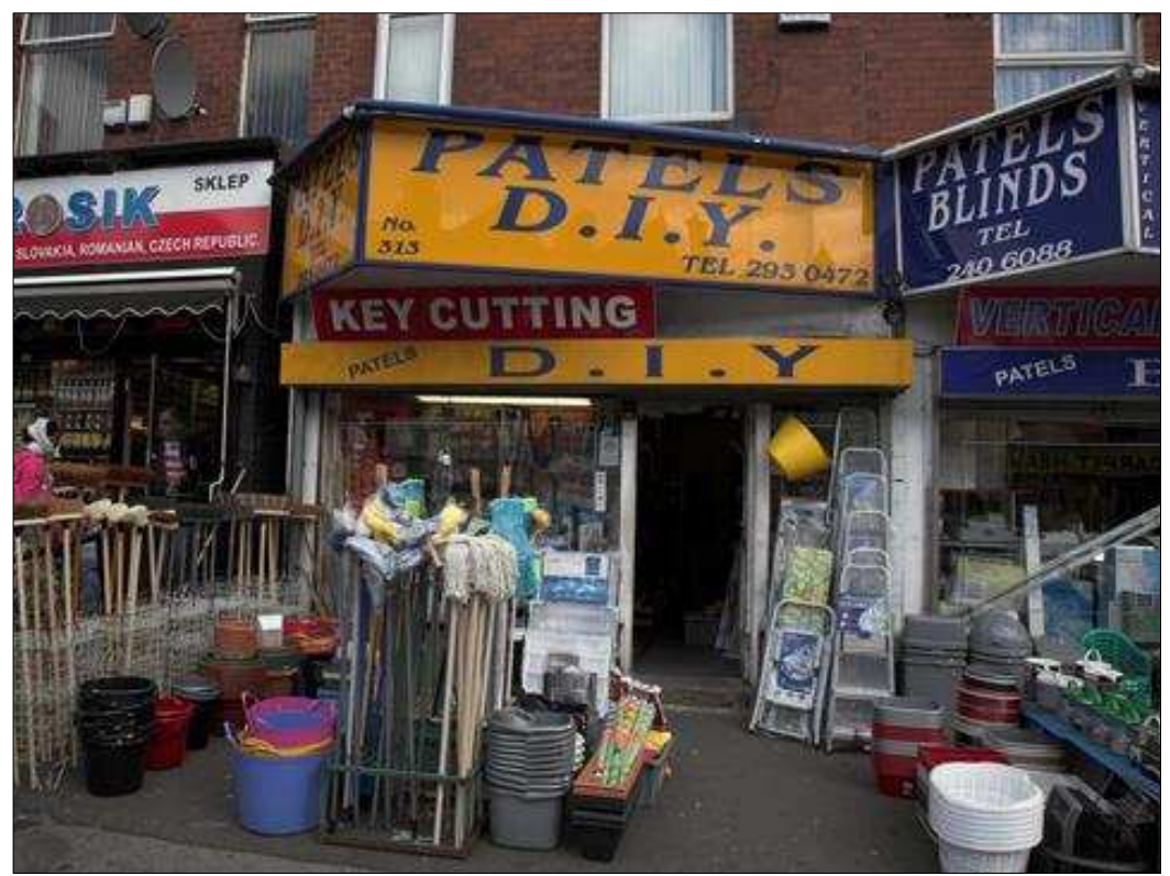
[Figure 7. Shop on Harehills Lane.]

Harehills Lane is a main road which takes us towards the periphery of Harehills. This is a migrant area at a much earlier stage of development, a high street along which shops spring up to cater to more recent arrivals, among them EU migrants and refugees seeking asylum. As we know from the current humanitarian crisis in Europe, refugees often arrive with little or nothing and are hence struggling to equip themselves with the basics for survival.