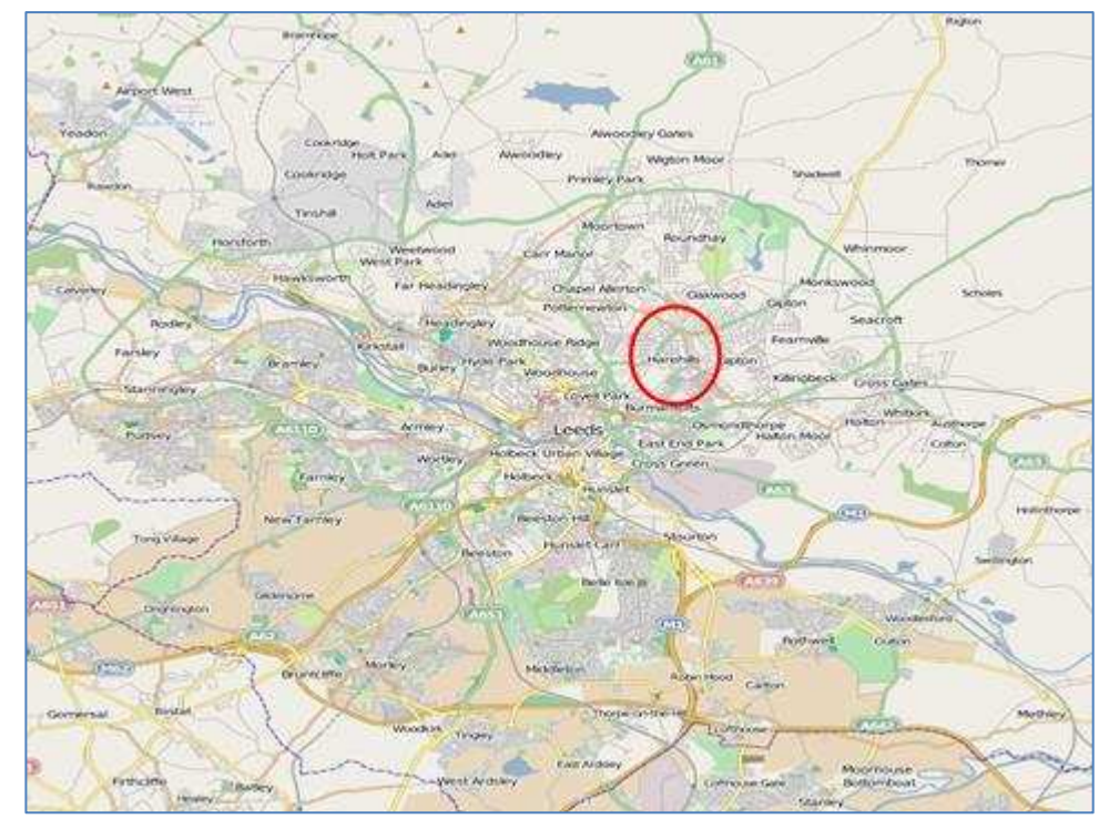
[Figure 2: Leeds, indicating Harehills, 1.5km from the city centre.]

We characterise Harehills as superdiverse, like many of the world's urban areas. The term superdiversity was coined by the sociologist Stephen Vertovec: his 2006 paper is usually cited as the original source. Superdiversity for Vertovec refers to a diversity which exists not just in terms of where people come from, but other variables including 'a differentiation in immigration statuses and their concomitant entitlements and restriction of rights, labour market experiences, gender and age profiles, spatial factors, and local area responses by service providers and residents' (Vertovec 2006: 1; see also Cooke 2010). The notion has been taken up and developed by sociolinguists interested in mobility, for instance Blommaert and Rampton (2011):