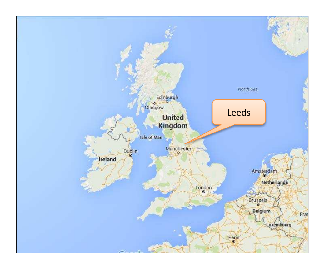
[Figure 1: UK, with Leeds indicated. Map data ©2015 Google]

The reality of contemporary multilingualism will be familiar to anyone who lives or works in an urban area. In the TLang project we look at language practices over time in public and private settings in four cities in the UK, to understand how people communicate multilingually across diverse languages and cultures. The overarching research question is: How does communication occur (or fail) when people bring different histories and languages into contact? One of the cities is Leeds, in the North of England. The Leeds TLang team are carrying out most of their research fieldwork in Harehills, an inner-city area a mile to the north-east of the centre of Leeds.