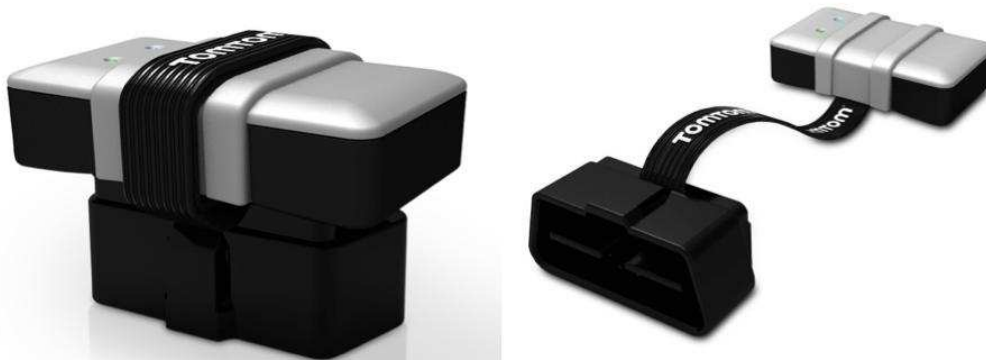
Figure 2 TomTom ecoPLUS™

During the trial the following information was collected: