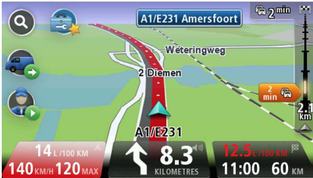
Figure 1 Information provided to the driver