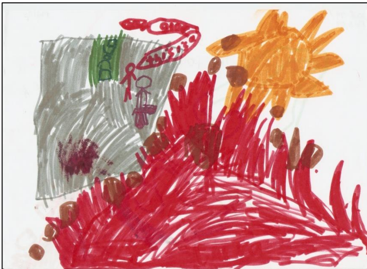
Figure 4 Snake and volcano

Zack should say 'shall I take this to school so I can play with this at playtime'.