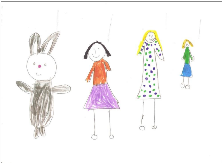
Figure 2 Tell me about your friends