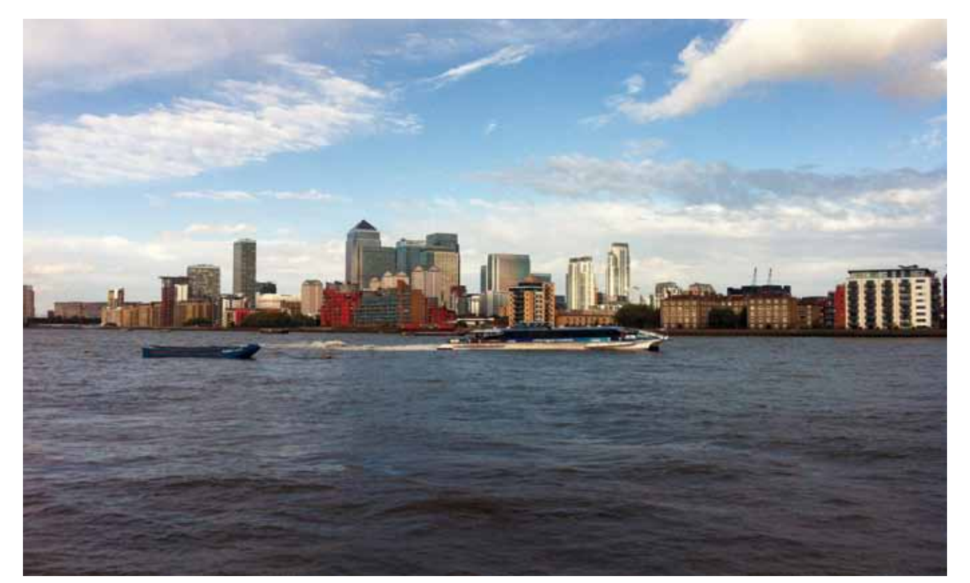
Many of the world's major cities, including London (pictured), have revitalised their waterfronts by making use of the available space.

Malta include the creation of a cruise ferry terminal, shopping centre and entertainment areas. In Hamburg, Germany they take the form of the HafenCity inner-city eco-development around the peripheries of the Port of Hamburg. Other major cities where redevelopment of waterfronts has taken place include Toronto and Montreal in Canada, Sydney and Adelaide in Australia, New York and Chicago in the US, Cardiff and London (docklands and Canary Wharf) in the UK, and Tokyo, Japan.