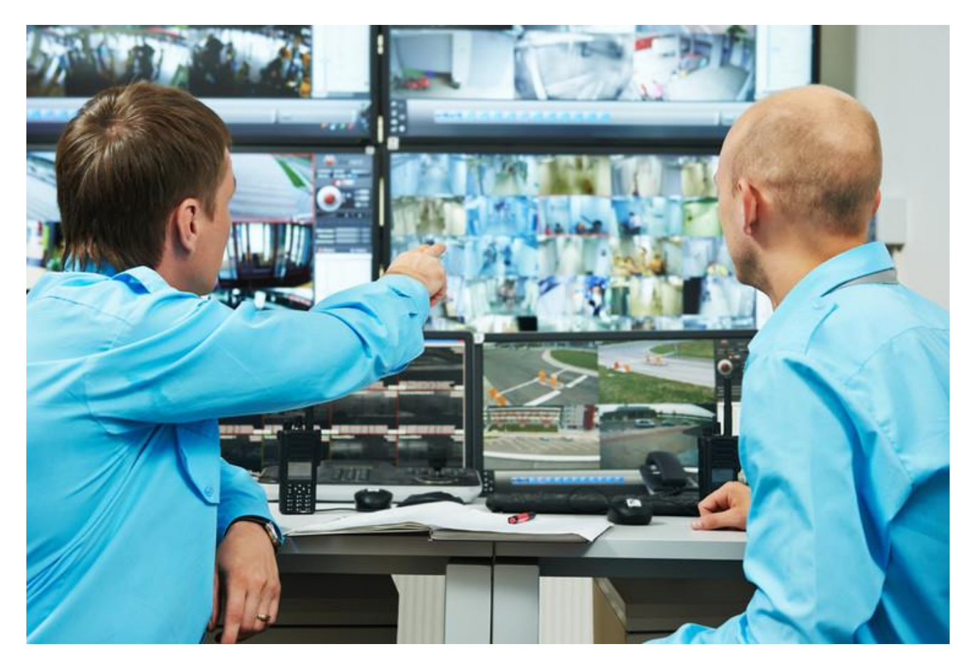
Could super recognisers be key in the fight against terrorism?

So how did the super recognisers do? Well, their performance on the GFMT unfamiliar facematching task was <u>outstanding</u>, where average error rates in the comparison group – of police trainees – reached 19%, average error rates for the super recognisers fell to just 4%, with one officer reaching perfect levels of performance.