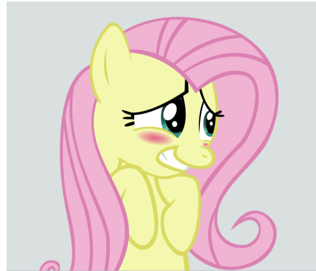
Figure 2: The villain.