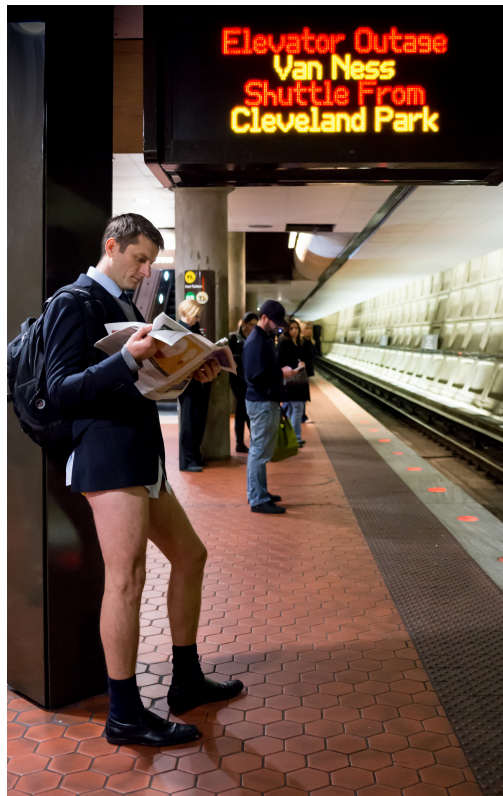
Figure 1: The design goal.