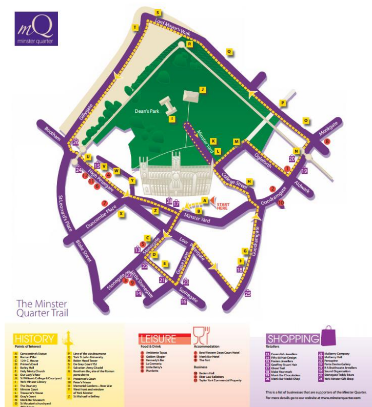
Figure 1 – York Minster Quarter Trial Map

visitors as the target age range for the application. Within York, the Minster Quarter is the initial scope of the game, the area holds many of York's attractions such as the Minster and Stonegate, Figure 1. Whilst the initial target area is relatively small, it is particularly affected by adverse tourism effects like footfall congestion, and also serves as a test site, which if successful could be expanded to the whole of York, then transferred to other cities.