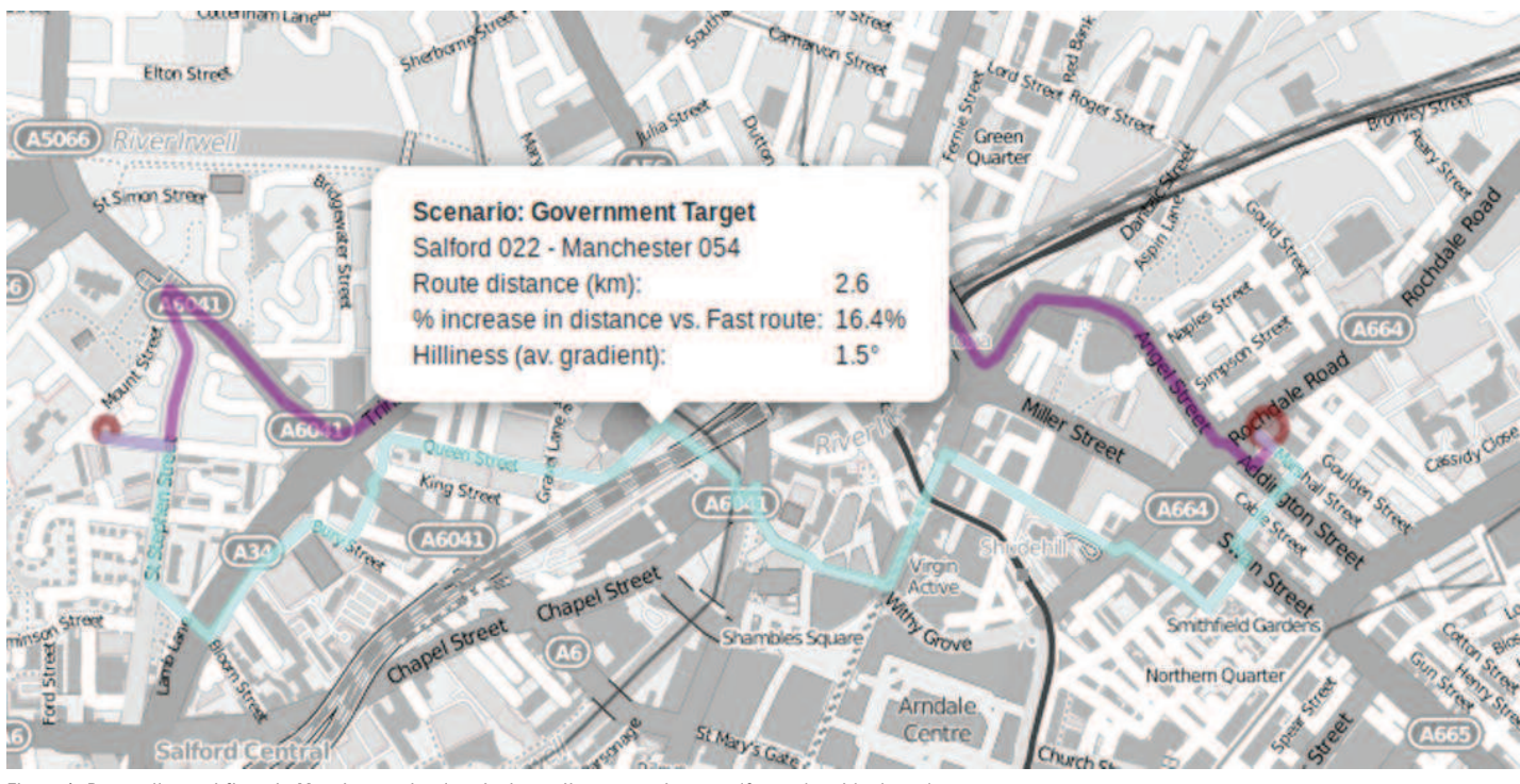
Figure 1: Route allocated flows in Manchester showing the large discrepancy between 'fastest' and 'quietest' routes

At the area level, the PCT shows the number of people in each zone (with an average population of 8,000) who reported cycling as their main mode of travel to work in the 2011 Census. In West Yorkshire, for example, the PCT shows the north of Leeds to have the highest rate of cycling in the region.