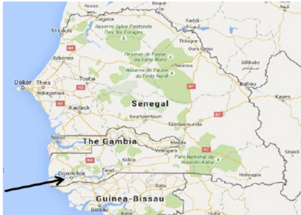
FIGURE 1. Map of Senegal

speakers (Lewis, Simons, & Fennig, 2014). Jóola languages are classified as members of Sapir's (1971) BAK group of Atlantic languages of the Niger Congo language phylum. Speakers of these languages are found in the Gambia, in the former Casamance region of Southern Senegal and in Guinea Bissau. The map in Figure 1, taken from Ethnologue, presents the languages of Senegal. The arrow on the map points to the Eegimaa speaking area (Bandial is the name used by Ethnologue for Eegimaa).