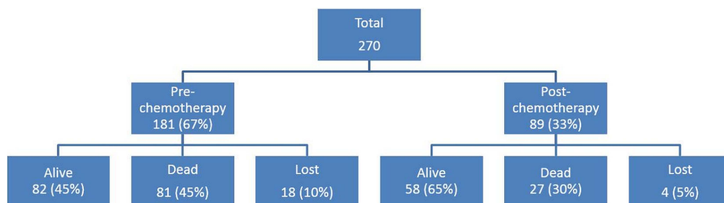
Figure 1 Summary of survival to 24 months after treatment for all children demonstrating an improvement in the post-chemotherapy era compared with the pre-chemotherapy era. Of the 89 children treated after chemotherapy was introduced, 70 received the drugs and 19 had surgery only. The case mix was similar for both periods.

Survival was improved among children treated after chemotherapy was available (figure 2); these children had a 37% lower risk of dying (HR 0.63, 95% CI 0.41 to 0.99) compared with children treated before chemotherapy became available. Age at diagnosis, sex and laterality did not have a statistically significant impact on survival. However, extent of the tumour did have an impact on survival, with children with extraocular involvement having an increased risk of dying (HR 4.6, 95% CI 2.8 to 7.8) compared with those with intraocular involvement only. Although the impact of chemotherapy on survival among children with extraocular involvement might be greater than in those with only intraocular involvement, there is as yet limited evidence of this since confidence limits overlap (figure 2B). Case mix in terms of laterality did not differ between patients treated before and after chemotherapy became available ( p=0.47 ), but there was a higher proportion of cases with undetermined extent in the children treated before the availability of chemotherapy ( p<0.0001 ). Furthermore, among children who survived with bilateral disease, the introduction of chemotherapy was associated with an increase in the number in whom some vision was saved (figure 3). Overall, 3 of 13 (77%)