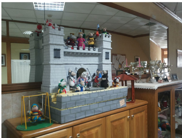
Figure 2. Some of the crafts on display at a day centre. These crafts were ‘produced’ by the day centre attendees.

and other structures like ditches and fences serve to obstruct military personnel from moving freely from one space to another, even though it also provides them with a form of cover (Kunze, 2007). The day centres are planned in such a way that divisions have been ‘smoothed out’. These divisions, on the one hand, are the walls and other boundaries that separate rooms from one another. On another level, they are the social boundaries between people. It is the attendees’ subjective presence that is given importance. All the attendees can readily see who is present and can also easily make out who did not turn up, (they have no ‘cover’ and ‘cannot hide’). This gives them the power of knowing and the self-confidence that comes with that knowing. The metalanguage employed in the architecture is thereby one that promotes togetherness and mutuality amongst the day centre attendees and not one that promotes divisions.