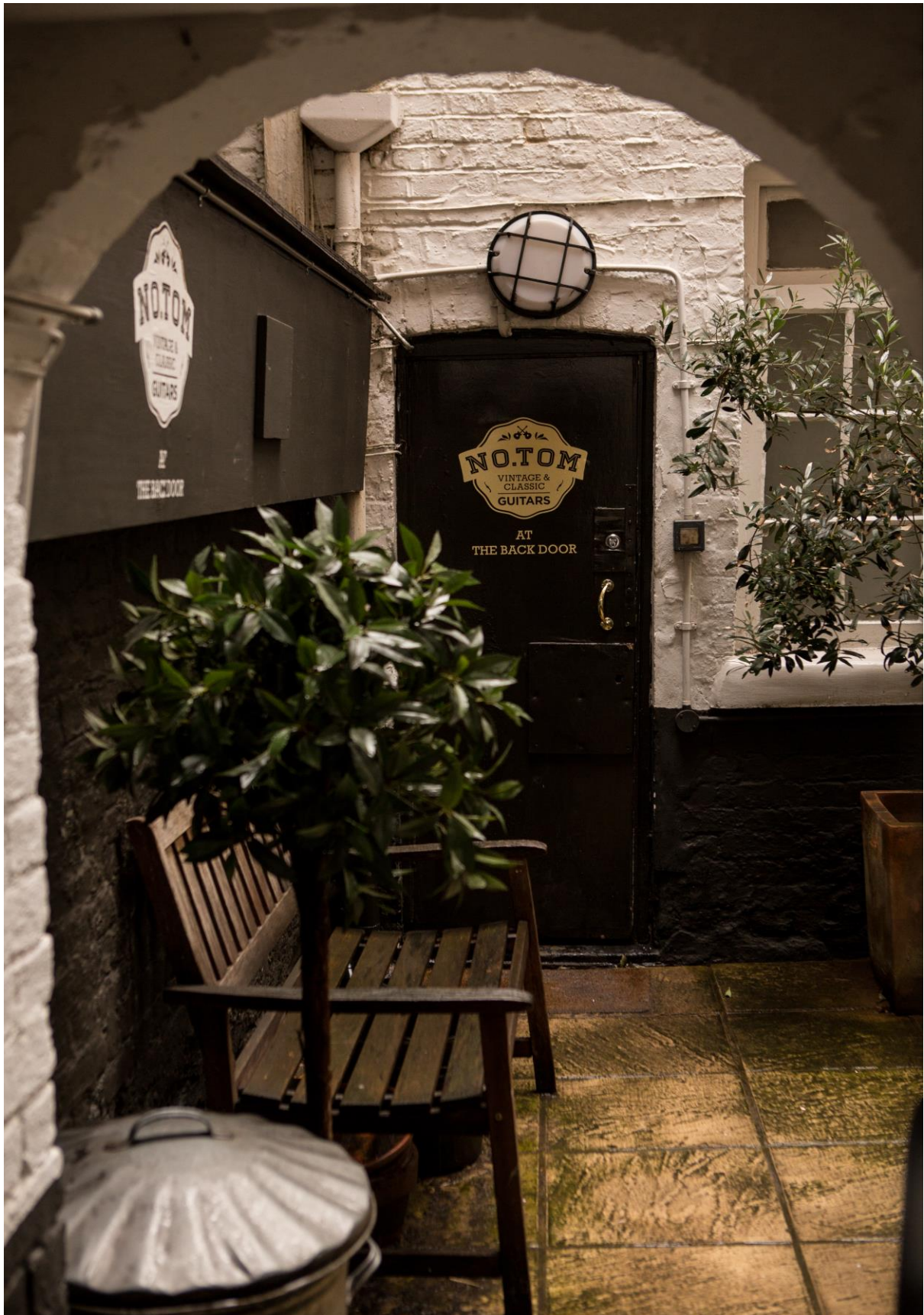
Figure 1: Entrance to the annex occupied by the Sex Pistols, at the rear of 6 Denmark Street.