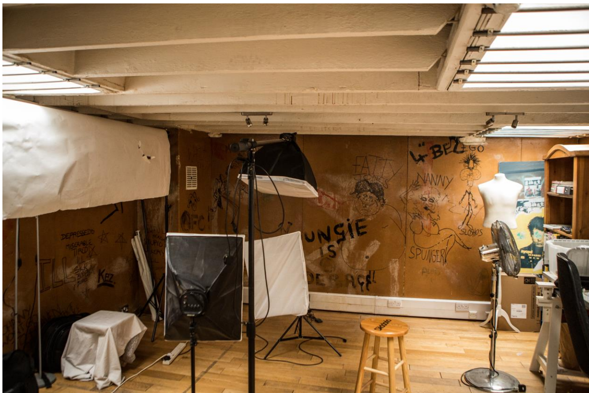
Figure 3: The upstairs living space, with artworks visible behind furniture and photographic props.