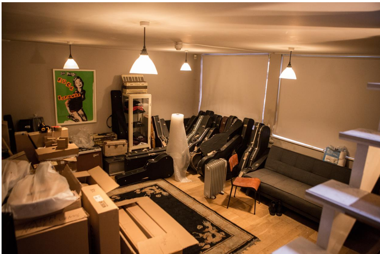
Figure 2: The ground floor of the annex, formerly the recording studio.