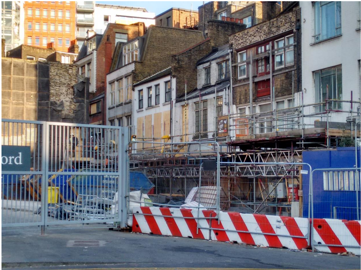
Figure 4: St. Giles development and the partially demolished Denmark Place in 2015, showing the north side rear of Denmark Street. Image PGB