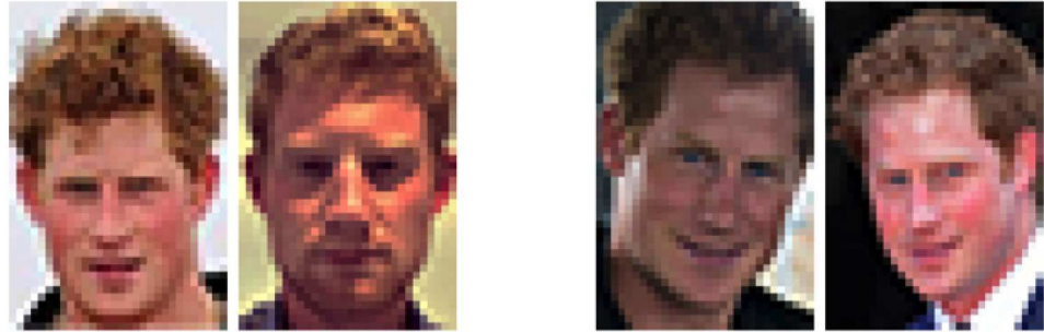
Fig 3. Example trials from the PLT. Images on the left show different identities (with the imposter face on the right). Images on the right show the same identity.