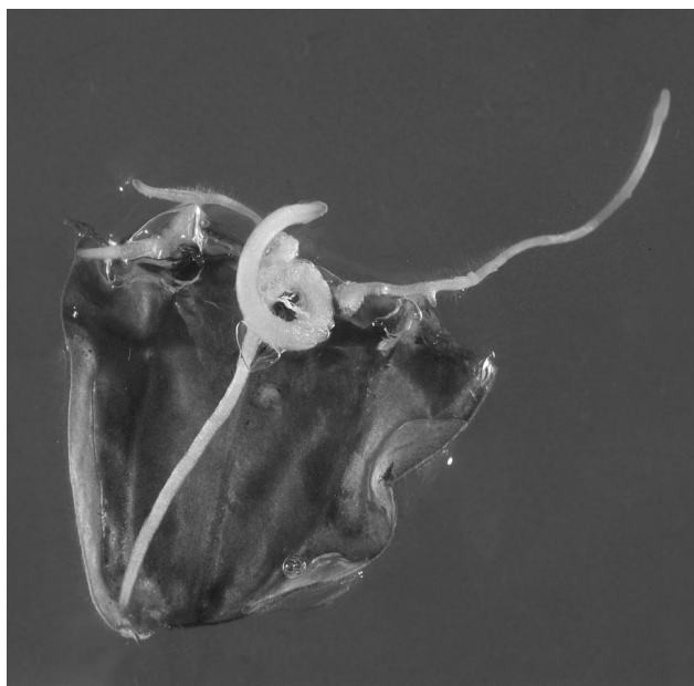
FIG. 3. Rooting from cucumber cotyledon inoculated with rhizogenic A. radiobacter strain (NCPPB 4042) 12 days postinoculation.

Transformation efficiencies varied between species, with rhizogenic Agrobacterium strains having an average rate of nearly 64%, compared with rates of strains from the Rhizobium and Ochrobactrum clades which averaged nearly 44% and 46%, respectively. The single rhizogenic Sinorhizobium sp. had a transformation efficiency of 75%, although individual rhizogenic Agrobacterium , Rhizobium , and Ochrobactrum strains also had similarly high rates.