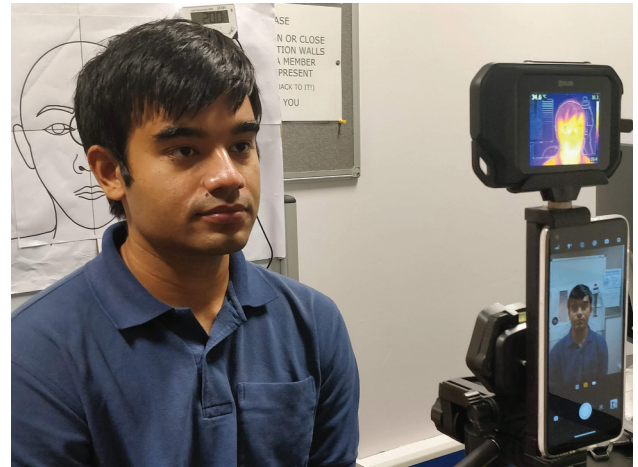
Fig 1. The FLIR C3 IR camera workstation with participant alignment, digital photography and IR thermography. IR = infrared.

First, IR and digital photos were taken using a FLIR C3 thermal camera and a Moto G8 smartphone. The tripod-mounted IR camera was positioned 0.6 m from the participant's face and the participants were positioned to align their head with a reference frame to maintain image ratios (Fig 1). One IR image was taken of