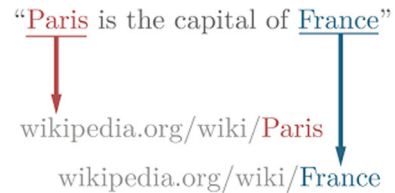
Fig. 2 Named entity disambiguation example