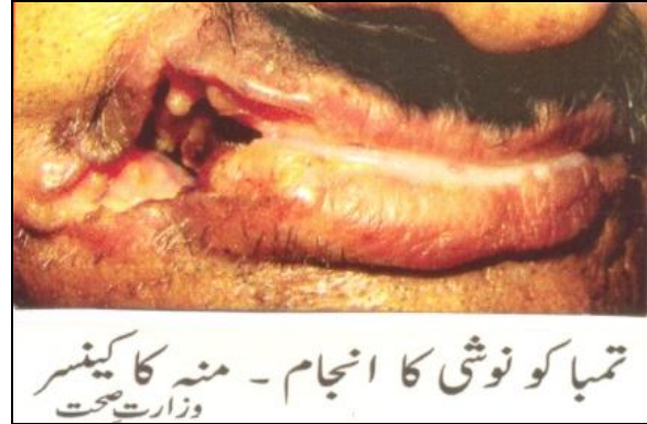
Figure-2: Warning displayed on cigarette brands

The cigarette sellers were asked for the attributes of their daily customers. The results showed that every day around 125 customers belonging to different age and gender buy cigarettes in different quantities. Majority (115, 92.0%) of the customers were male while only 10 (8%) were female. The majority (72, 57.6%) of the customers were in age group 20–40 years, followed by 26 (20.8%) in 41–60 years age group, and below 20 years age group was (5.6%) (Table-1).