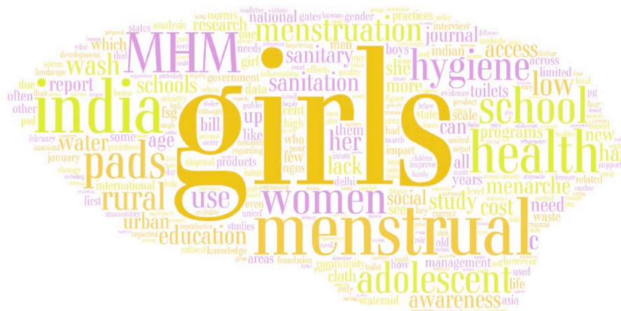
Fig. 2. Wordcloud representing a semantic analysis of 57 online sources addressing menstrual hygiene management in India.

Since she had been living in the slum for the last fifteen years, we questioned her about the views of the younger generation of women in the slums towards the use of sanitary napkins and whether they would