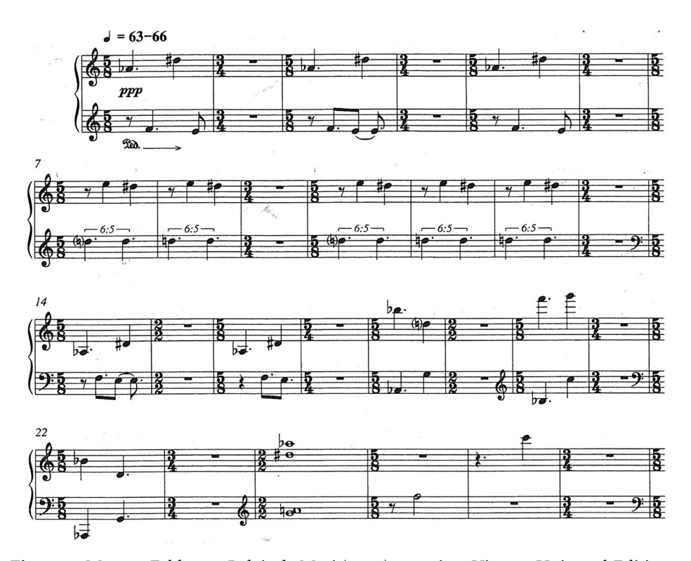
Figure 1. Morton Feldman, Palais de Mari (1986), opening. Vienna: Universal Edition.

Feldman's works of the mid-1970s onwards create complex perceptual effects through the use of rhythmic, melodic and harmonic processes that are highly patterned but constantly evade pure and absolute repetition, presenting fractionally changing materials in ever-different contexts at very low dynamics. Palais de Mari comprises small modules of material: sometimes short blocks of one or just a few bars, interrupted by rest bars of different lengths—anything from 3/16 to 2/2: Figure 1 shows the opening of the piece. Importantly, the pedal stays down through the 'rests', focusing attention on the decay of the sound. Other sections comprise extended passages of long chords that are then repeated but transposed slightly