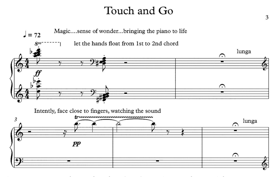
Figure 2. Roger Marsh, Touch and Go (2014), opening. London: Decipherer Arts Press.