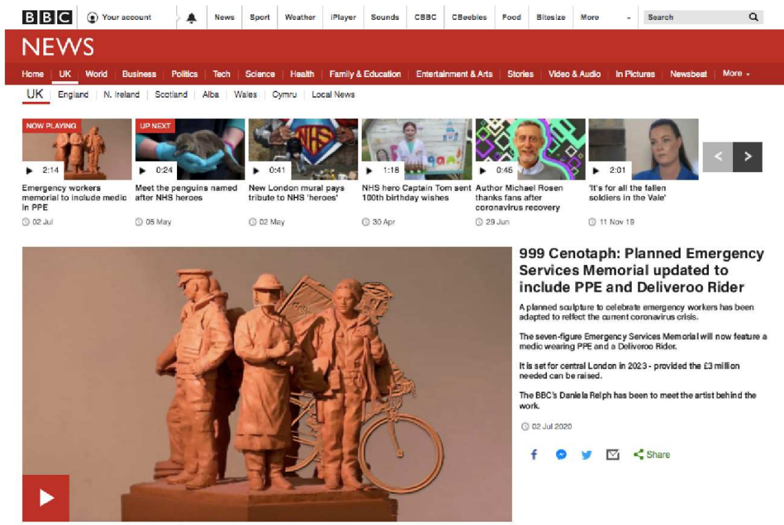
Figure 2 A modified news article describing a new statue for key workers, that has been modified to include a gig working cyclist.

The statue (Figure 2) is a response to this, and although provocative, represents a sense of injustice in being forgotten key workers doing difficult and dangerous work for low pay. The concept proposes to literally cement the courier as a recognised permanent fixture in the city, which contrasts with the transient and dynamic nature of the realities of their day-to-day work, and their perceived diminutive role in the community. Later, in 2021, the IWGB union campaign “Clapped and Scrapped” (IWGB, 2021) highlighted this frustration in how couriers had been poorly treated by platforms during the pandemic, during a time when the public were showing appreciation for key workers and local businesses were almost entirely relying on their service.