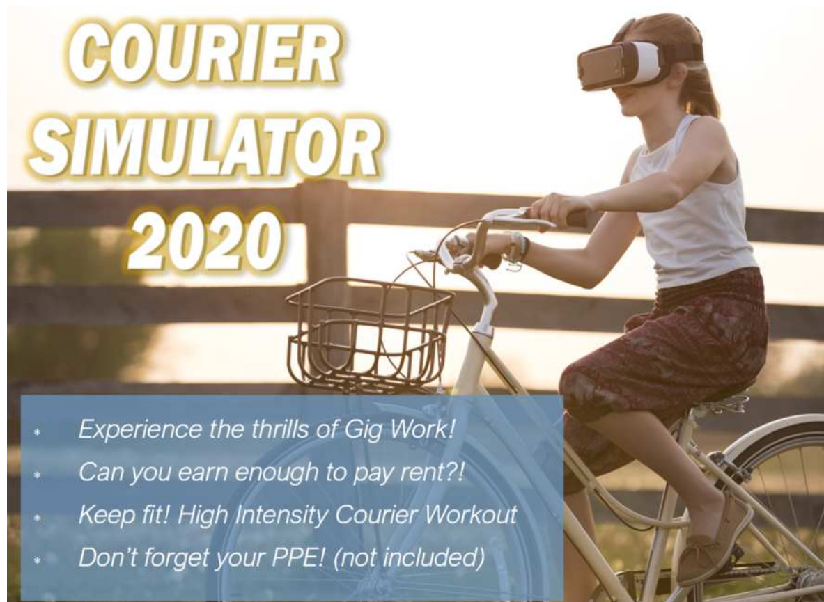
Figure 5 An advertisement for “Courier Simulator 2020” describes the features of the game

All the participants in the workshops used bicycles as their main vehicle. Although riders had many issues with their work and employment, they were also very careful to highlight the joys of this kind of work. Alongside the factors such as being somewhat flexible in their working hours, and in some cases being able to do work while “on holiday” for apps that allowed riders to work in different cities, there was also a strong feeling that riding bicycles was itself enormously rewarding and joyful. The fun of riding a bike, getting exercise and being outdoors for their work was a common positive point.