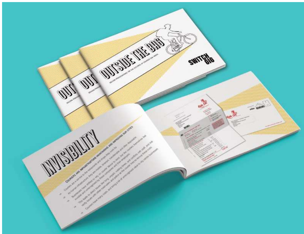
Figure 1 The design fictions are collected into a booklet that contains further elaboration on the issues faced by couriers in their work