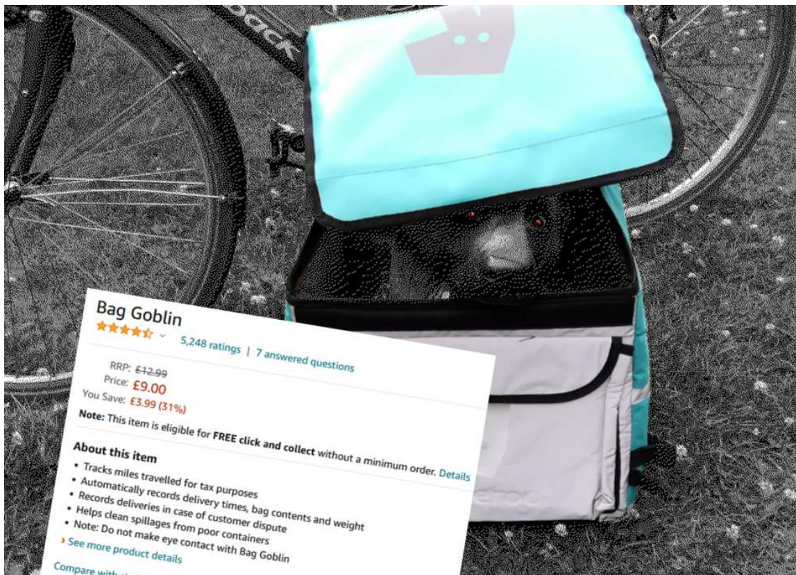
Figure 4 Bag Goblin

Part of this self-defence is by repurposing external apps like Strava (a cycle tracking app) to record their work and using their phone camera frequently to record evidence for when things seem like they might go wrong. This kind of data is also valuable when filing tax returns, since in the UK riders can claim tax relief based on using their vehicle for work.