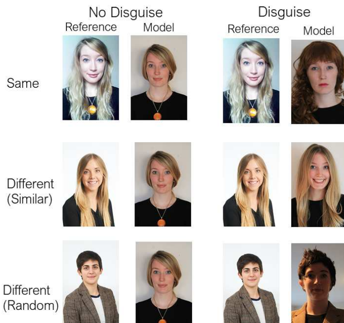
Figure 1. Example of same-identity and different-identity image pairs. The photograph on the left is always a reference photograph, and the photograph on the right either a same or different-identity photo trying to look unlike themselves (evasion) (far left) and like someone else (impersonation) (middle and right).

image. Models often went to great lengths to do this, by wearing wigs, growing/shaving beards, changing their hairstyles, and by applying or removing make-up worn in the reference image (See Figure 1). The same-identity disguise image pairs consisted of the reference image and the image of the model in evasion disguise.