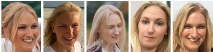
Figure 3. Example of the types of ambient images provided by the models for use in this experiment. The images in Figure 3 are illustrative of the experimental stimuli and depicts author EN who did not appear in the experiments.

images did not include any deliberate attempt to disguise appearance (see Figure 3). The test stimuli were again the 156 FAÇADE matching task pairs.