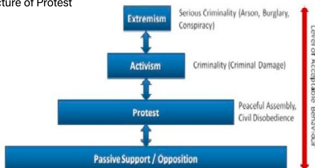
[Fig 1, 'The Structure of Protest', NPCC 2016]