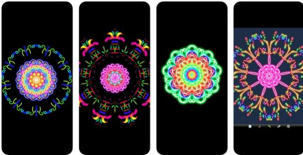
Figure 1. Kaleidoscope Drawing Pad (Bejoy Mobile 2012), a casual creator which involves creation of abstract art through touching the screen.

Casual creators are a genre of software that playfully facilitates creativity which is enjoyed for its own sake, rather than the sake of the quality of the product (Compton & Mateas 2015). Examples include applications for generating visual imagery, combining basic musical elements into music pieces, or choosing an image from a set to generate similar art. For example, in the app Kaleidoscope Drawing Pad (Bejoy Mobile 2012) (Figure 1), touching the screen generates kaleidoscopic images for amusement.