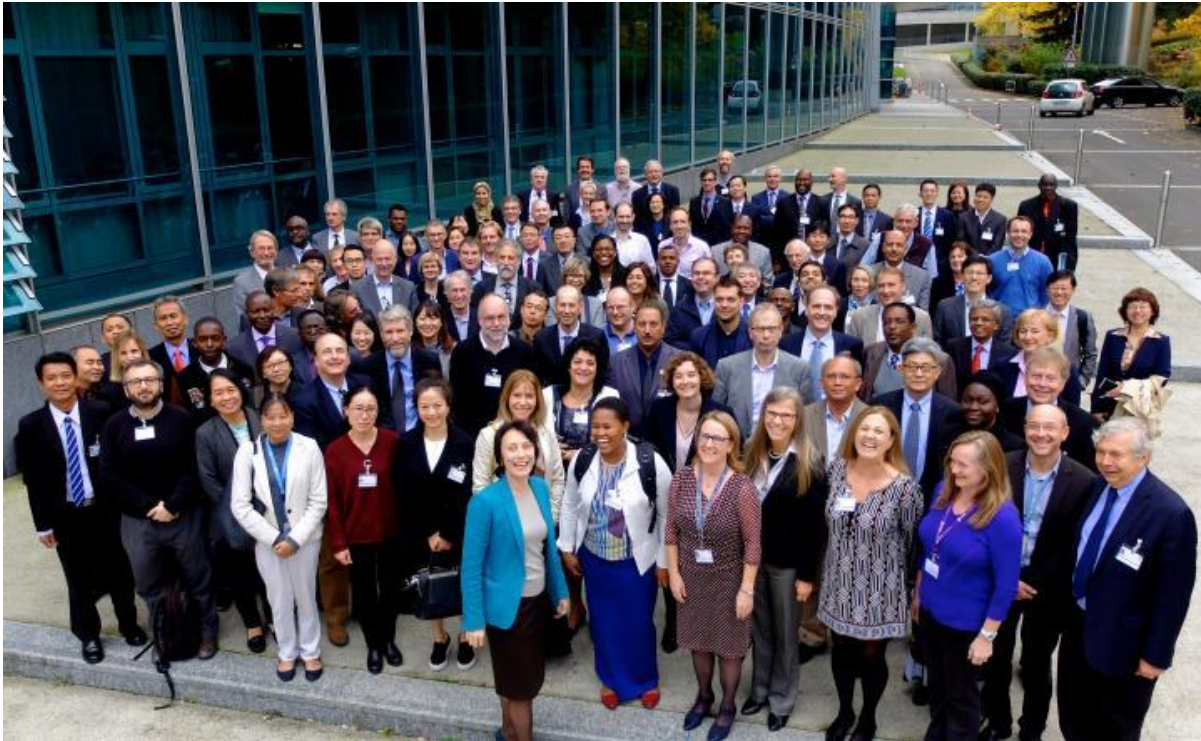
Figure 1: Participants of the Science Summit, held from 20 – 22 October 2017 at the World Meteorological Organization’s headquarters in Geneva, Switzerland. A full list of participants is provided in the online supplement.