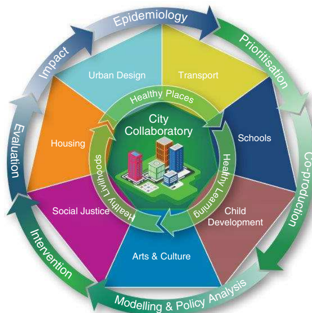
Figure 1. The City Collaboratory model utilises wide interdisciplinary expertise based in three inter-linked themes: Healthy Places, Healthy Learning and Healthy Livelihoods.

We have started our co-production activities, developing, refining and prioritizing the suite of activities outlined in each work