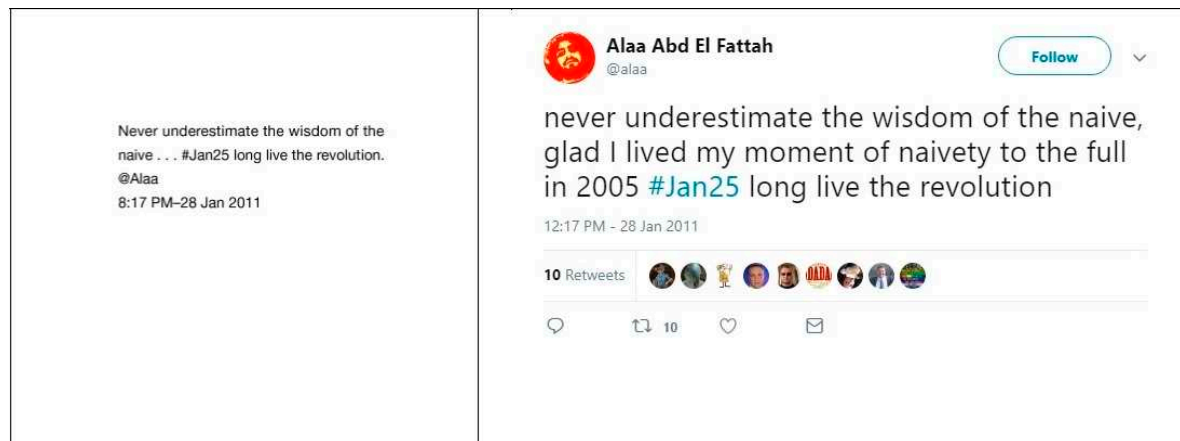
Figure 2. (Left) p. 3 of The City Always Wins ; (Right) Alaa tweet about ‘the wisdom of the naive’. 28 January 2011.