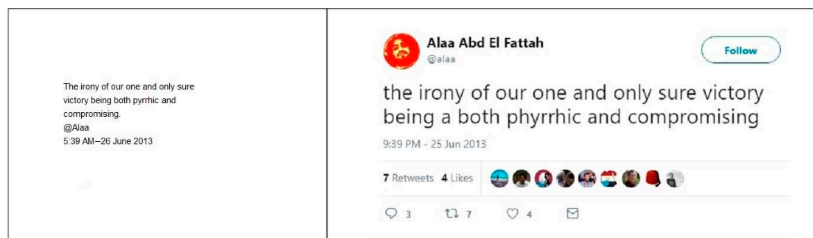
Figure 4. (Left) p. 183 of The City Always Wins ; (Right) Alaa tweet about a ‘pyrrhic [sic] victory’. 25 June 2013.

As Mason (2013) demonstrates, YouTube played an important role in global uprisings as an evidence broadcasting site. If it was Facebook that publicized Khaled Said’s murder by torture, it was his attempt to upload a video documenting police corruption that triggered that torture in the first place. Launched in 2005, the video-sharing site rapidly attracted both controversy and a vast number of clicks. Over time, it was put to action holding the mighty accountable for their transgressions,