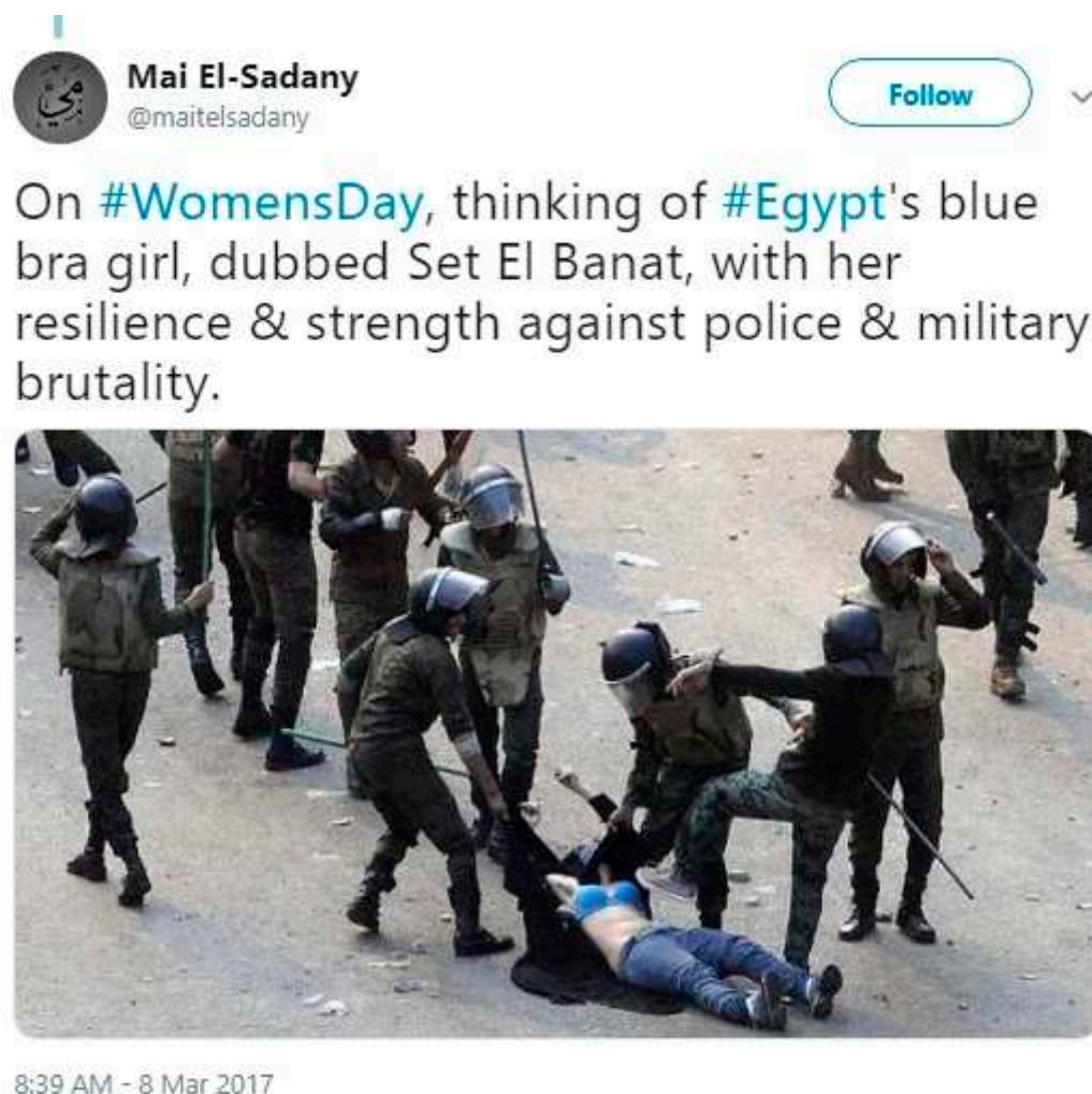
Figure 5. Mai El-Saday tweet with picture of 'blue bra girl'. 8 March 2017.

corrects an older relative for her inaccurate diction when the latter claims that the young woman and her friends use particular language 'on the Face' (Hamilton 2017a, p. 155), behind the humour are signals that Facebook political chatter is far removed from most Egyptians' daily concerns.