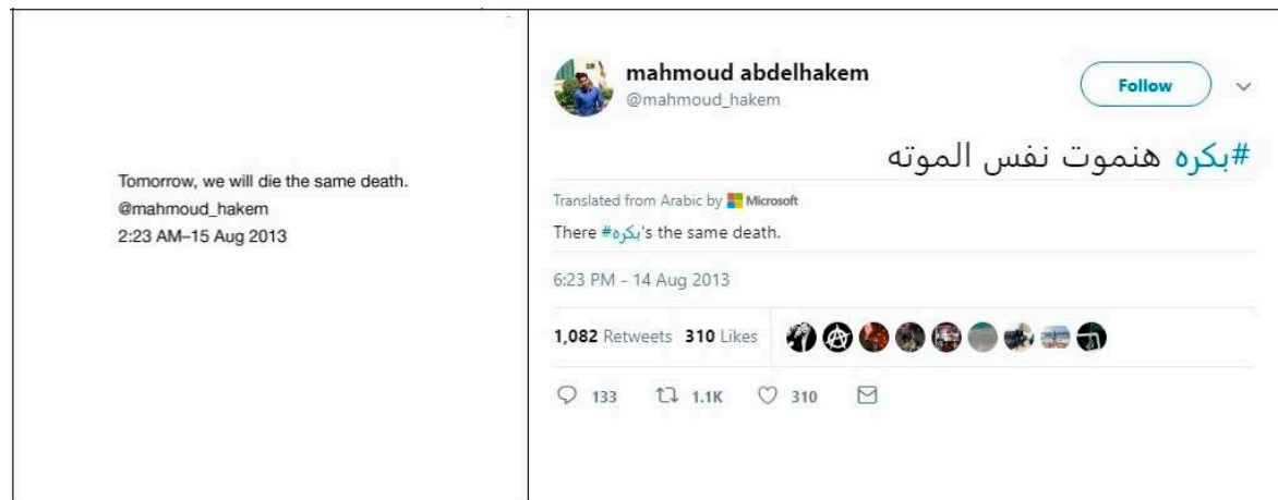
Figure 3. (Left) p. 209 of The City Always Wins ; (Right) Mahmoud Abdelhakem tweet about dying ‘the same death’ at the Rabaa massacre. The Arabic hashtag, left untranslated by Microsoft Translate, means #tomorrow. 14 August 2013.