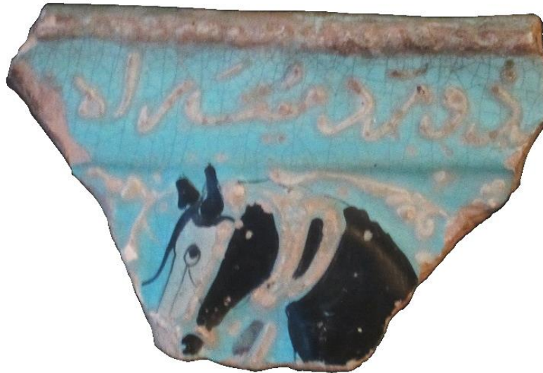
Fig. 6. Mīnā'ī tile fragment excavated in Konya Urgench, Turkmenistan