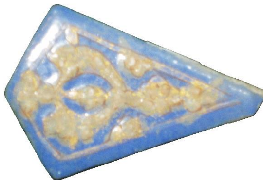
Fig. 4. Mīnā'ī tile fragments, excavated in Kunya Urgench, Turkmenistan