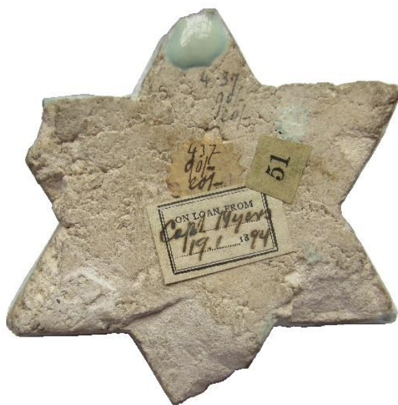
Fig. 3. Kilij Arslān II Kiosk, Konya (after F. Sarre, Der kiosk von Konia , Berlin, 1936 pl.1) (L), and the rear of a mīnā'ī tile. The Victoria and Albert Museum, London (R)