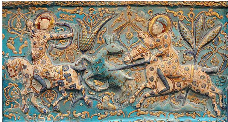
Fig. 9. Large mīnā'ī vase. Christies (L), and a relief mīnā'ī tile. Museum für Islamische Kunst, Berlin (R)