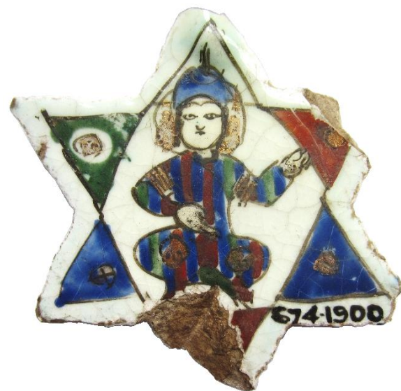
Fig. 8. Mīnā'ī bowl. David Collection, Copenhagen (L), and mīnā'ī tile from Konya. The Victoria and Albert Museum, London (R)