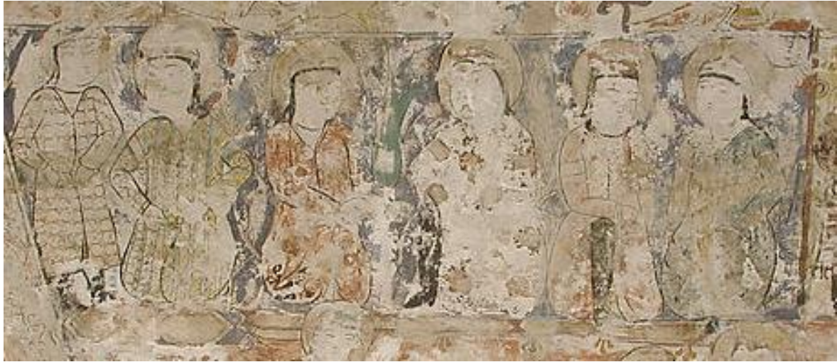
Fig. 1. Painted stucco wall panel (thirteenth century). The Metropolitan Museum of Art, New York