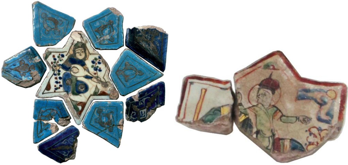
Fig. 12. Mînâ'î tile with figure playing the lute from Konya. Museum für Islamische Kunst, Berlin (L), and a section of an eight-point star mînâ'î tile. Karatay Museum, Konya (R)