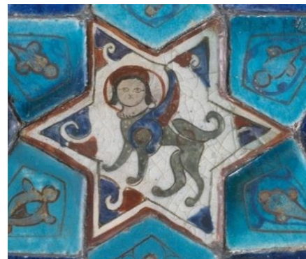
Fig. 7. Detail of horse and sphinx from a mīnā'ī bowl in the British Museum (1930,0719,63), British Museum, London (L), and a six-point mīnā'ī tile with sphinx from Konya. The Metropolitan Museum of Art, New York (R)