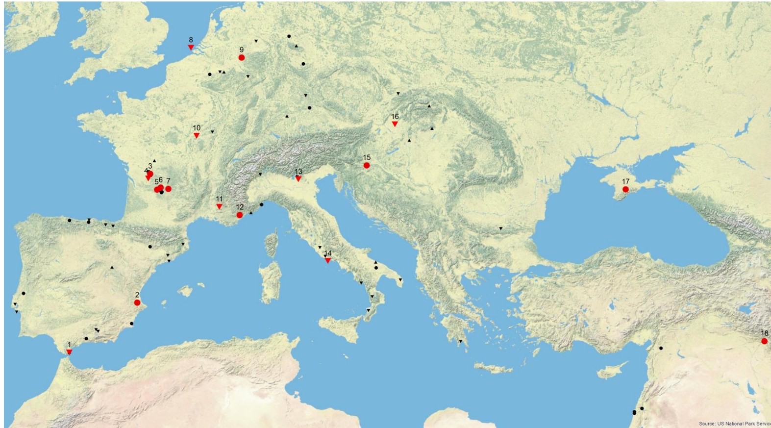
Figure 2. Sites with Neanderthal skeletal material and key sites with probable evidence of recovery through care. Healthcare case studies (see Table 1) are in red and numbered: 1) Forbes' Quarry, 2) Cova Negra, 3) Les Pradelles, 4) La Quina, 5) La Ferrassie, 6) Regourdou, 7) La Chapelle-aux-Saints, 8) Zeeland Ridges, 9) Kleine Feldhofer, 10) Arcy-sur-Cure, 11) Bau de l'Aubesier, 12) Saint Césaire, 13) Riparo Mezzena, 14) Guattari, 15) Krapina, 16) Šaľa, 17) Kiik-Koba, 18) Shanidar. Neanderthal skeletal material (black) is compiled from Nespos and (Diedrich 2014) with additions). Symbols: ▾ cranial/dental material only ▲ postcranial material only • near complete or partial skeleton.