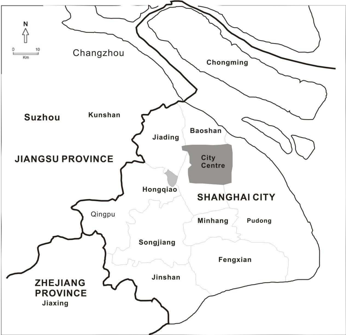
Figure 1 -- Location of Hongqiao in Shanghai.