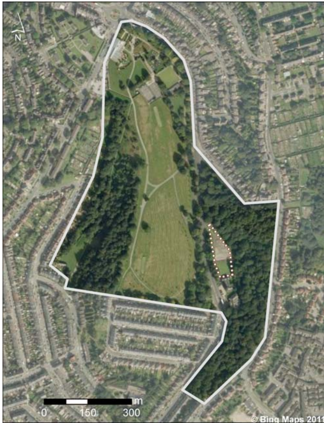
Figure 1. Aerial map of Firth Park. The solid line shows the park boundary; dotted line indicates an area under redevelopment in 2010–12