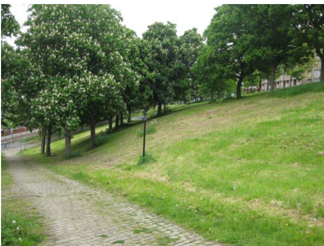
Figure 5. A typical view of greenery in Sheaf Valley Park

Sheaf Valley Park was the name given to a new city park underpinned by a vision of linking a series of open spaces