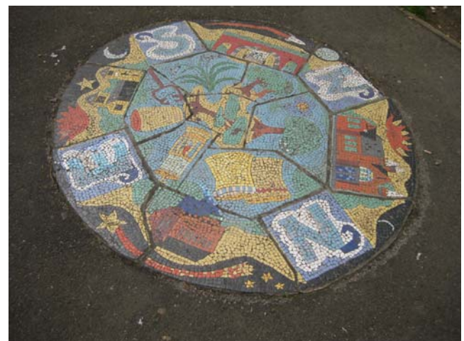
Figure 3. A symbolic artwork telling the story of Sheffield in Firth Park

Hinde Common Wood are situated on one side of a main road, Firth Park Road, with the rest of the park and recreational and community facilities on the other side.