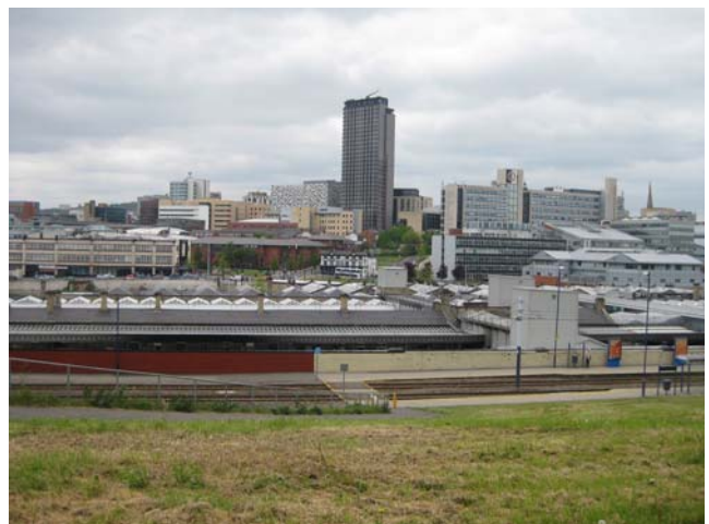
Figure 6. A view from Sheaf Valley Park towards Sheffield’s city centre

Before conducting the rec-mapping, the participants attended a class-based session, which focused on the background and general understanding of the eight experiences and outlined the practicalities of carrying out a site analysis based on these experiences. Through early feedback from participants, it became clear that there were some difficulties in applying the terms as described in Table 1 because of differences in language interpretation and cultural understandings. For