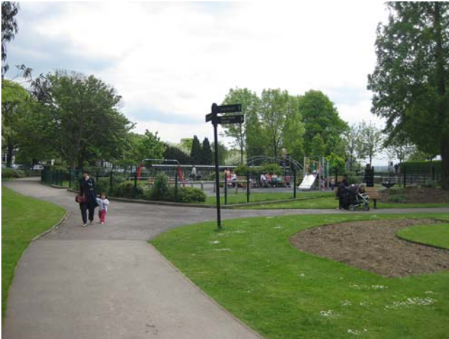
Figure 4. A early spring view of playgrounds and facilities in Firth Park

Firth Park is one of Sheffield’s oldest and most historic parks, opened in 1875, and fell into decline in the late 1970s. The establishment of the ‘Friends of Firth Park’ group in 1999 was central to the reversal of Firth Park’s decline (Burton, 2010). The rec-mapping exercise was conducted in all parts of the park apart from Hinde Common Wood due to time constraints.