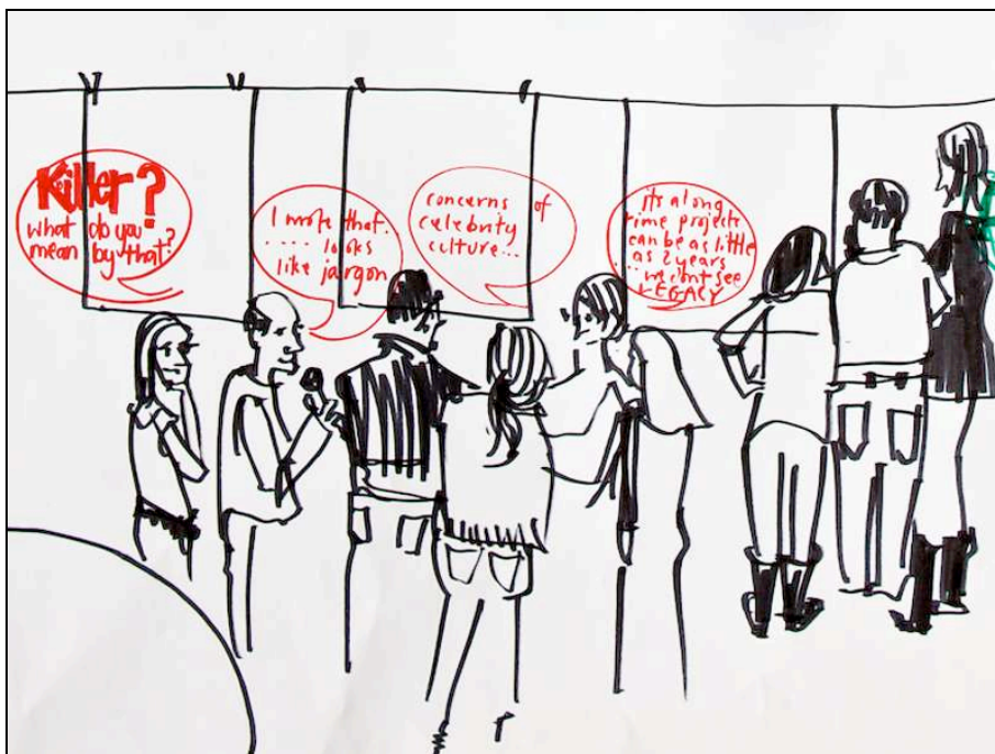
Figure 2. Illustration of World Café, Skills in Action festival.

Definitions of KE emerging from the research programme included broad forms of engagement that spanned from, “every time you open your mouth [to speak]” [WorldCafé], to “any discussion of my topic area outside traditional university teaching/research setting” [ECRchat3], and “Maybe just getting to talk with people outside the ‘normal’ research/teaching environment?” [ECRchat5] More conventional definitions such as “exchange of know-how” [PhD3], and “Creating networks and sharing expertise” [PhD7] also emerged.