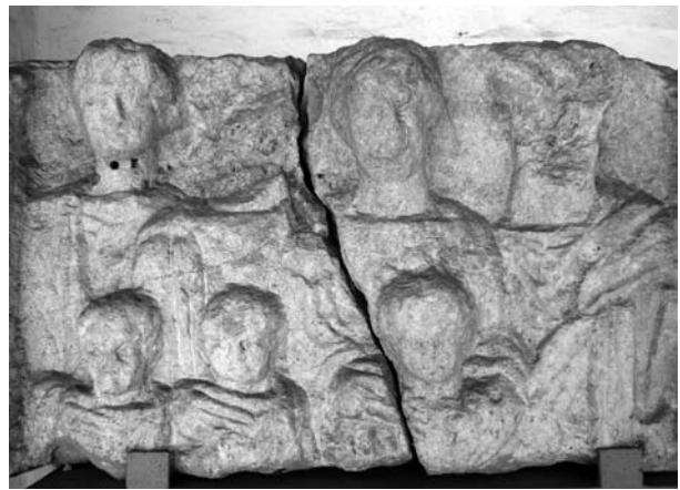
Fig. 5. Gravestone of a large family in Aquincum , early 3 rd c.

Even families who were not indigenous to the area adopted the custom of displaying an extended family with more than one child, making use of local sculptors who were adept at carving such scenes. Syrian troops of the cohors miliaria Hemesenorum stationed at Intercisa from the late 2 nd – mid-3 rd c. belong to those incoming groups who adopted indigenous Danubian commemorative formulae in format and content (Fitz 1972; Mócsy 1974, 227-230). This unit did not recruit locally, but was replenished repeatedly with troops from the province in which it was raised, almost certainly because these soldiers were archers not readily available elsewhere (Cheesman 1914). Germanus Valens, a soldier in