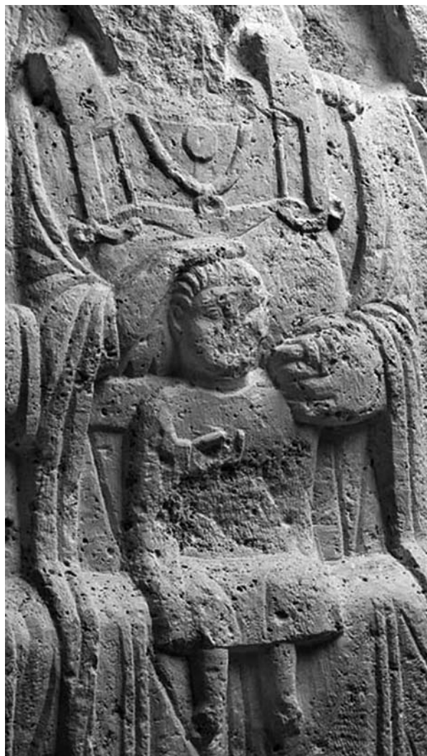
Fig. 4. Grave stela of an indigenous family from Intercisa , late 2 nd /early 3 rd c. Detail of one of the women with her child.

The popularity of family scenes with children amongst the indigenous population had a profound impact also on military families, especially after soldier marriages were recognised under Septimius Severus and recruitment in the army involved tapping into increasingly sedentary military families for fresh manpower. Soldiers often