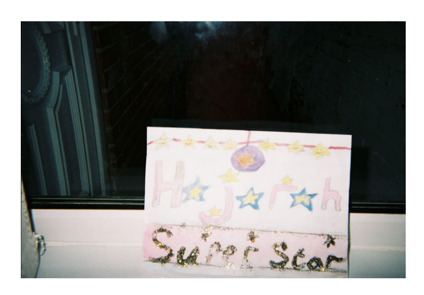
Figure 1. Glitter image.

Here, writing was linked to Tanya's interest in sparkle and gold using watercolors and glitter. The aesthetics of glitter could be partially linked to her enjoyment of glittery forms as demonstrated by this website, which was recorded in field notes as being regularly used by the family at the time of the data being collected, Craft 4Kids: http://www.crafts4kids.co.uk/sequin-and-mosaic-art/c12, but also could be linked to the category "gold," which I found was often strongly linked to home values in British Asian homes (Pahl and Pollard 2008).