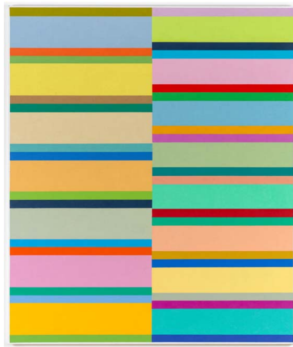
Figure 3: Jon Thompson's The Toronto Cycle no. 19, Cadence and Discord (HM), Traer Los Sentidos (2011), oil on canvas.

Particularly inspiring was Thompson's use of colour in The Toronto Cycle 19, Cadence and Discord (HM) Traer Los Sentidos (Figure 3). The colour palette seems to be in keeping with the work of British painter and printmaker Patrick Caulfield (1936 - 2005).