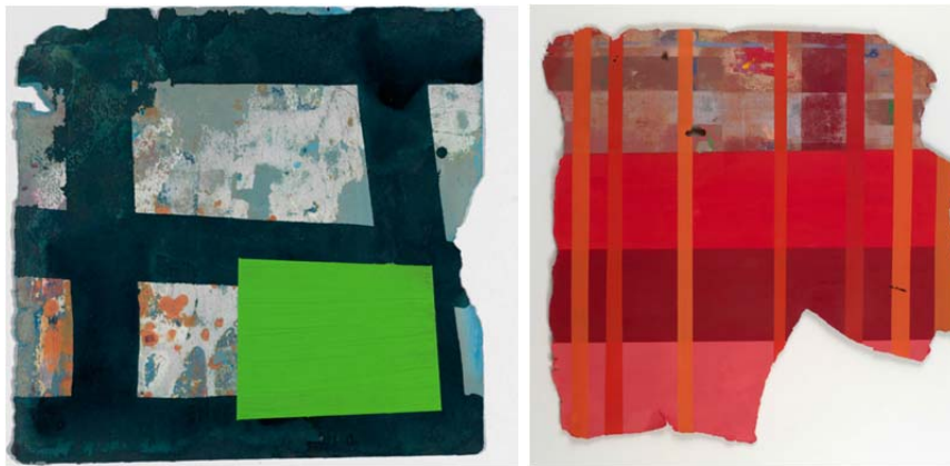
Figure 7 (left): Kevin Laycock, series number 17 (2006), oil on gesso on paper.