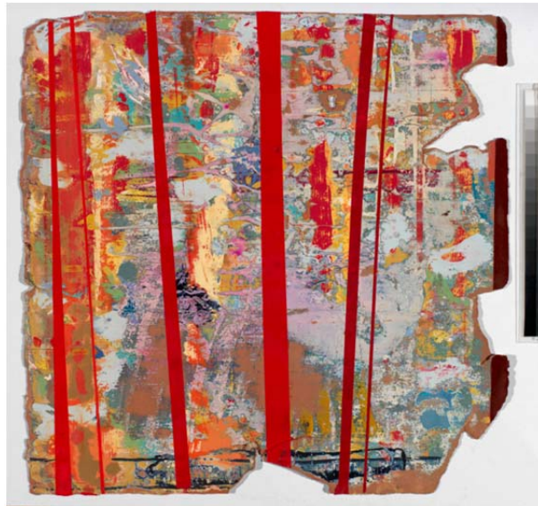
Figure 4: Kevin Laycock, Uncertain Harmonies, series number 6 (2006), oil on gesso on paper.

In traditional Western harmony, cadences are used in sequence to create specific harmonic effects at the beginning, middle and end of compositions. At the start of the series, the cadences were positioned in a similar fashion on each of the picture planes. This approach limited the possibilities for composition. Within the context of the Uncertain Harmonies series, the definition of a tonal range is based on seven colours derived from any primary, secondary, tertiary or neutral colour becoming either progressively lighter or darker in tonality. For example, in Uncertain Harmonies, series number 6 (Figure 4), the surface of this painting was worked heavily with geometric tonal ranges of reds, yellows and corresponding earth colours.