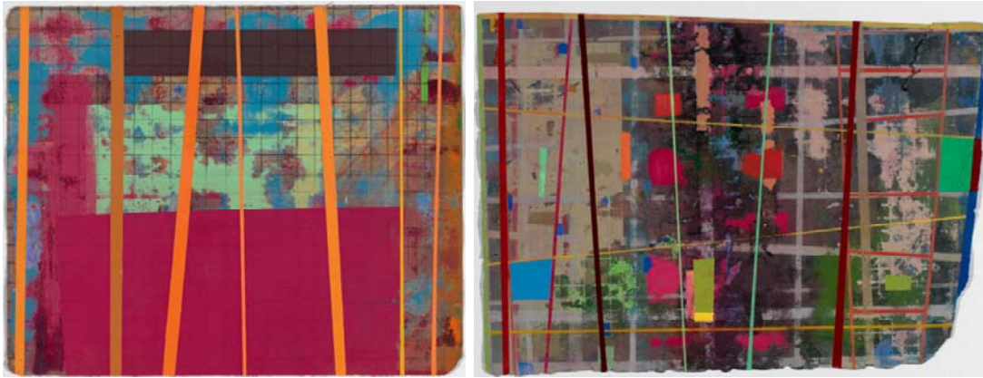
Figure 5 (left): Kevin Laycock, series number 3 (2006), oil on gesso on paper.