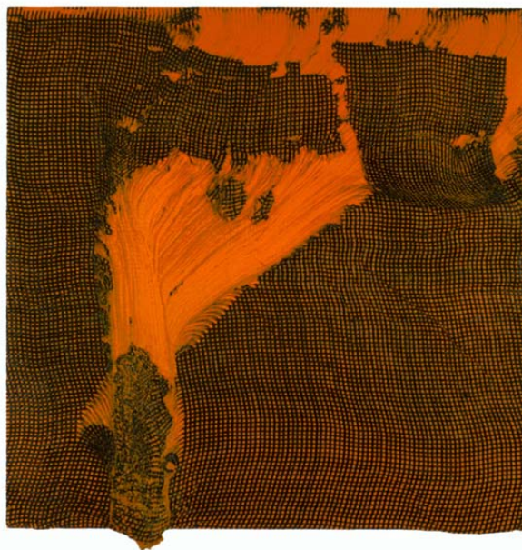
Figure 2: Alex Harding's Ruinart, II (2001), oil on gloss paint on MDF.

This relationship between order and instinct are highlighted further in Whittle's commentary on Uncertain Harmonies from 2007, '...ethereality and definition, give Laycock's paintings their characteristic feeling of rhythm married to fluidity, their Musicality' [7]. Whittle uses the term musicality to define the collective qualities of the series, the paintings were in part composed using a musical system, a system that is constantly at odds with intuitive art and design practice. The tension that Whittle speaks of can be seen in other contemporary abstract painters such as Alex Harding, consider Ruinart, II from 2001 (Figure 2). Although Harding employs grid structures, the grids are not used to place or locate motifs, but instead the grid becomes the motif. Harding pours enamel or gloss paint on to fresh oil paint to make loose linear networks. As the process develops, the grids slide and disintegrate across the oil paint ground. Then, as the physical qualities of the two materials react, the grid structure becomes physically fused establishing a unified paint surface. Harding's handling of colour, paint and process is bold and confident, a quality reflected in the Uncertain Harmonies series.