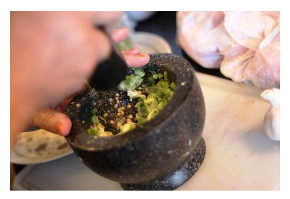
Figure 4: Nazra's 'macho' display

whole head of garlic, complete with skin, because she "can't be bothered" to spend time peeling and chopping individual cloves with a knife in the way that her son does.