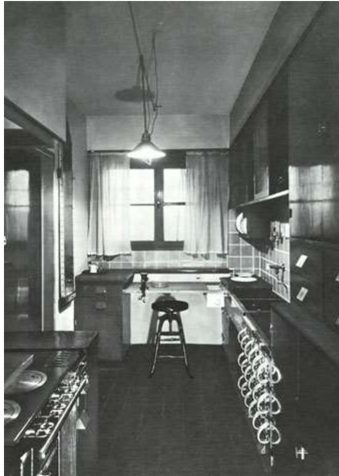
Figure 1. The Frankfurt Kitchen 1926, designed to reduce women's labour in the home 9

Both experiments were premised upon 'applying a certain sort of knowledge about space, which would in turn create rational and orderly subjects to inhabit it' (Jerram 2006, p. 538). Essentially, this involved ' enforc [ing housing planners'] visions through the use of space' (Jerram 2006, p. 539 [original emphasis]). The two models differed, crucially, in the way that the space was conceptualised. In Frankfurt, the architects of this project, Ernst May and Grete Schütte-Lihotzky, chose to abandon the traditional German working-class practice of combining the social space of the family with the 'workplace' of the woman in a single wohnküche ('living room-cum-kitchen') (Jerram 2006, p. 541). The 'expert knowledge' upon