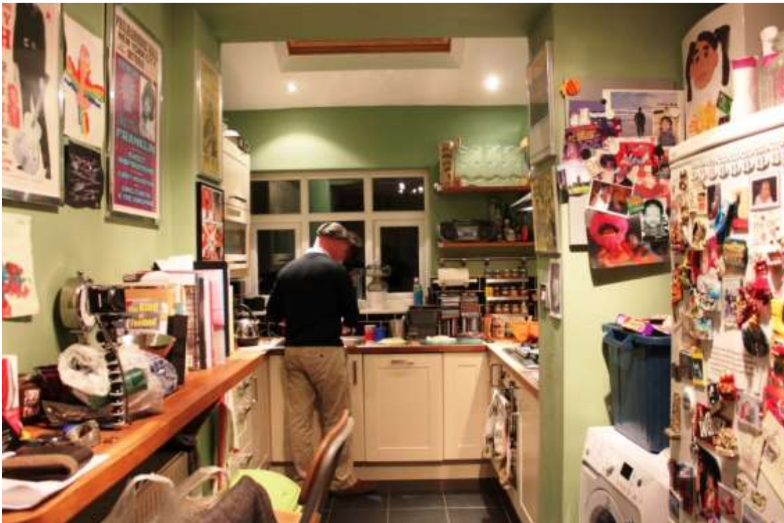
Figure 5. A kitchen-museum 23

the past while simultaneously creating the possibility of prospective memory (Meah and Jackson, in press). From wedding china to children's drawings, a jug to a fridge magnet, individuals' consumption, appropriation, use and display of material artefacts demonstrate the portability of memory, which may be transferred from one kitchen to another, thereby facilitating the transformation of a space into a place.