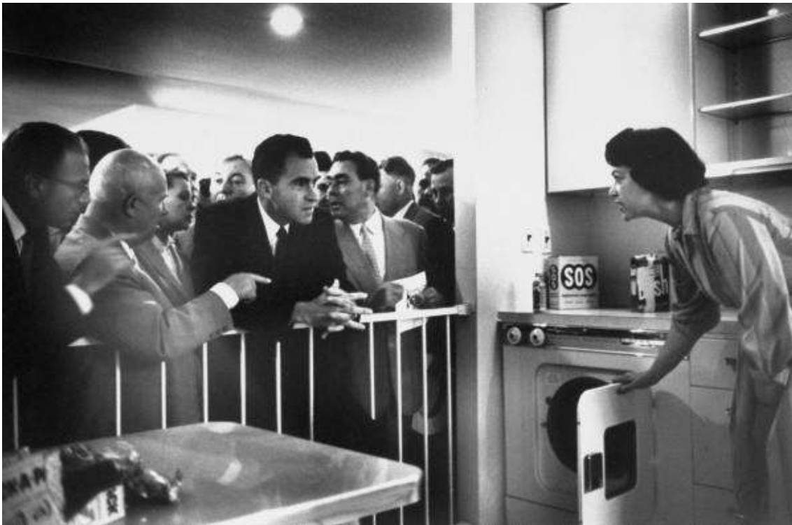
Figure 4. Khrushchev and Nixon and the showcase kitchen at Sokolniki Park 17

showcase kitchen, Nixon argued that this was a symbol of the comfort and luxury available to the common American (see figure 4) (Scanlan 2011, p. 343) 15 . Scanlan (2011, p. 342) argues that – over half a century later - the MoMA exhibition display, visions of plenty , charts the shift from ‘ideas to aesthetics, as the role of design changed from creating an ideal world to creating a consumer culture’ 16 .