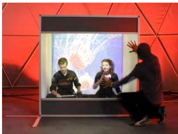
Figure 1. humanaquarium .

Permission to make digital or hard copies of all or part of this work for personal or classroom use is granted without fee provided that copies are not made or distributed for profit or commercial advantage and that copies bear this notice and the full citation on the first page. To copy otherwise, or republish, to post on servers or to redistribute to lists, requires prior specific permission and/or a fee. NIME2010, 15-18 June 2010, Sydney, Australia Copyright remains with the author(s).