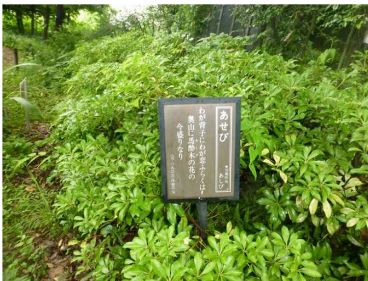
Figure 6: Akatsuka shokubutsuen man'yō-yakuyōen

For example, Akatsuka shokubutsuen man'yō-yakuyōen presents the poems in the format indicated in Figure 6.