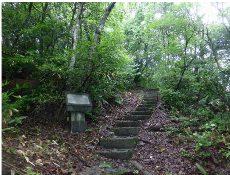
Figure 4: Futagami yama kōen man'yō shokubutsuen

A similar approach to this can be seen at Asuka rekishi kōen man'yō shokubutsuenro, although the path is somewhat more clearly defined at the latter, and also at the stand-alone Shōwa man'yō no mori, where the landscape is somewhat less steep.