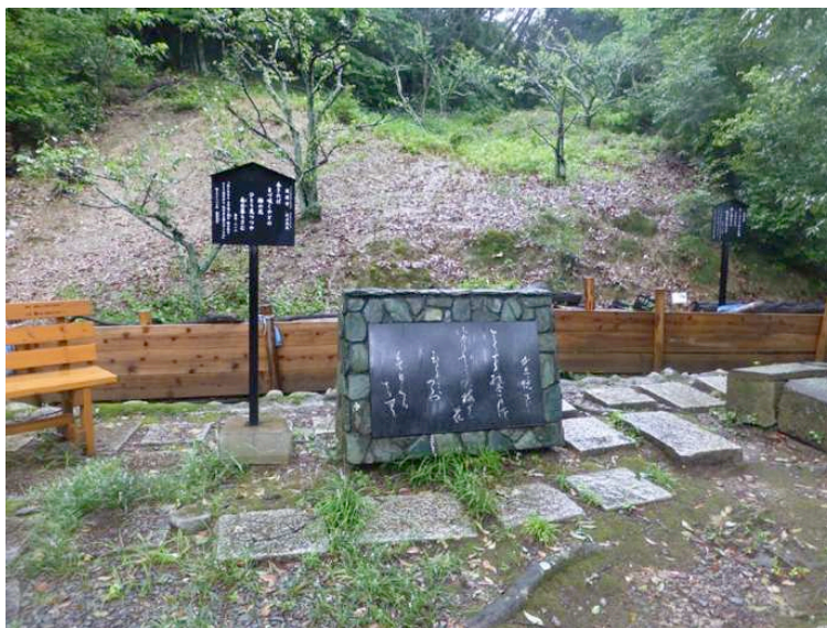
Figure 7: Kii fūdoki no oka man'yō shokubutsuen stone and explanatory plaques

aesthetic, rather than textual, object to understand the poem's contents as well as information about the plant to which it refers.