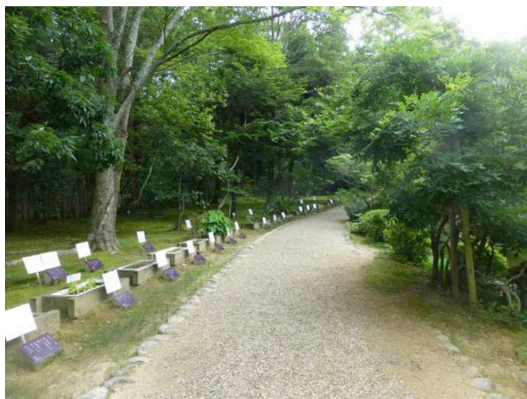
Figure 3: Kasuga taisha shin'en man'yō shokubutsuen

Other gardens, however, take an entirely different approach, and utilise minimal landscaping. This approach is particularly common among those facilities which are located in larger 'parks' whose function is to allow visitors to enjoy the natural environment by driving or hiking through it. For example, a visitor seeking Futagami yama kōen man'yō shokubutsuen (Toyama) needs to drive some kilometres up the mountain in order to locate the entrance to the botanical garden, while the garden itself consists of a trail through a section of the mountain with the paths simply marked, and the Man'yō plants fully integrated into the other foliage, with only the plaques identifying them to pick them out from their surroundings (Figure 4).