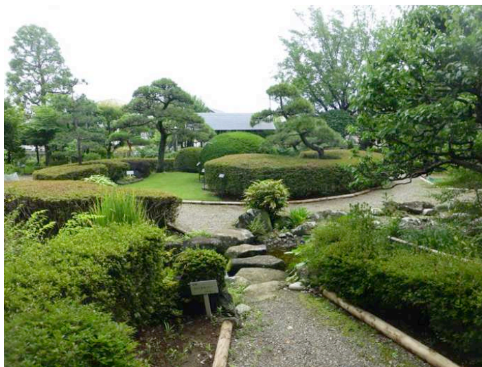
Figure 2: Ichikawa-shi man'yō shokubutsuen