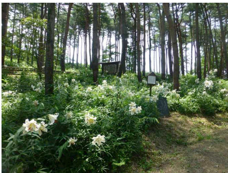
Figure 5: Shōwa man'yō no mori

A similar approach to this can be seen at Asuka rekishi kōen man'yō shokubutsuenro, although the path is somewhat more clearly defined at the latter, and also at the stand-alone Shōwa man'yō no mori, where the landscape is somewhat less steep.