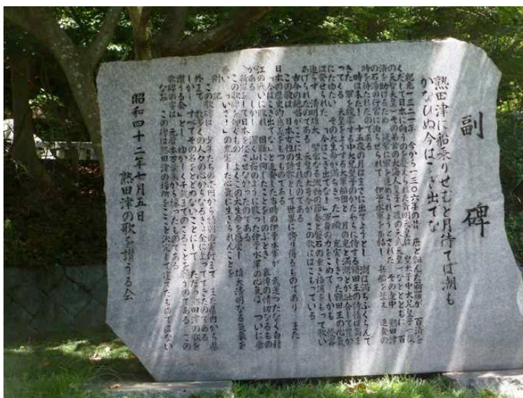
Figure 9: Ehime man'yōen explanatory stone plaque

There is a similar, monumental urge in the use of poems in their original script at Ehime man'yōen , where the only poem presented in this form is carved onto a polished stone slab attached to a much larger piece of rock. The importance placed on this particular poem is emphasised not only by both its physical positioning with substantial clear space around it, but also by the fact that it is accompanied by a large stone explanatory plaque (Figure 9). This plaque gives detailed background information on both the poem and the original man'yōgana plaque's production. It is accompanied by a smaller, painted, wooden plaque. This provides the poem in modern script, the name of the poet, biographical information about him, a summary of the poem's meaning, and brief information about the origin of the text used to produce the man'yōgana version of the poem for the original plaque. As in the case of the Man'yō no mori kōen monument above (Figure 8), this poem, too, makes no reference to a plant, and the importance placed on the poem comes from its association with the locality.