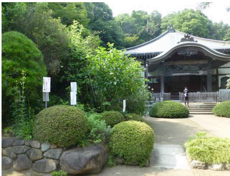
Figure 1: Kokubunji man'yō shokubutsuen