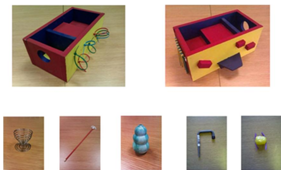
Fig. 1. The Unusual Box, and the Five Novel Objects

test was developed to measure DT in 2-year-olds. The Unusual Box Test (UBT) involves children playing with a colorful box with strings, hoops, stairs, ledges, etc., alongside 5 novel objects (see Figure 1) (Bijvoet-van den Berg & Hoicka, 2014). DT is determined by the number of different action/box area combinations children generate (see Methods). This test shows good test-retest reliability in 2-year-olds, and good validity in 3- and 4-year-olds when compared to the Wallach and Kogan test (1965), and the Thinking Creatively in Action and Movement (Torrance, 1981), another DT test that cannot be used with children under 3 years.