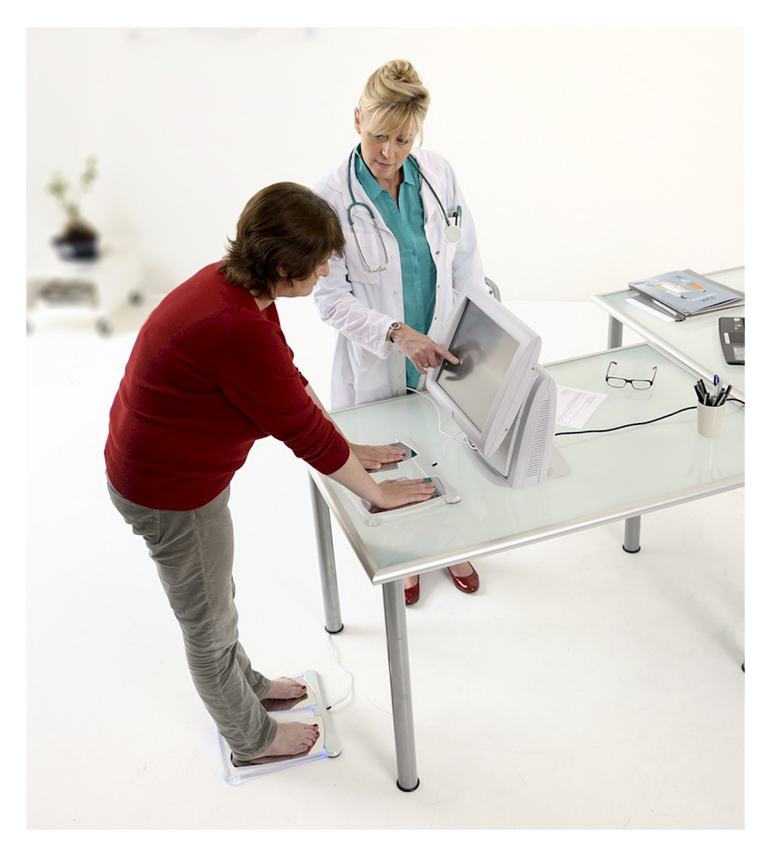
Fig 1. SUDOSCAN.